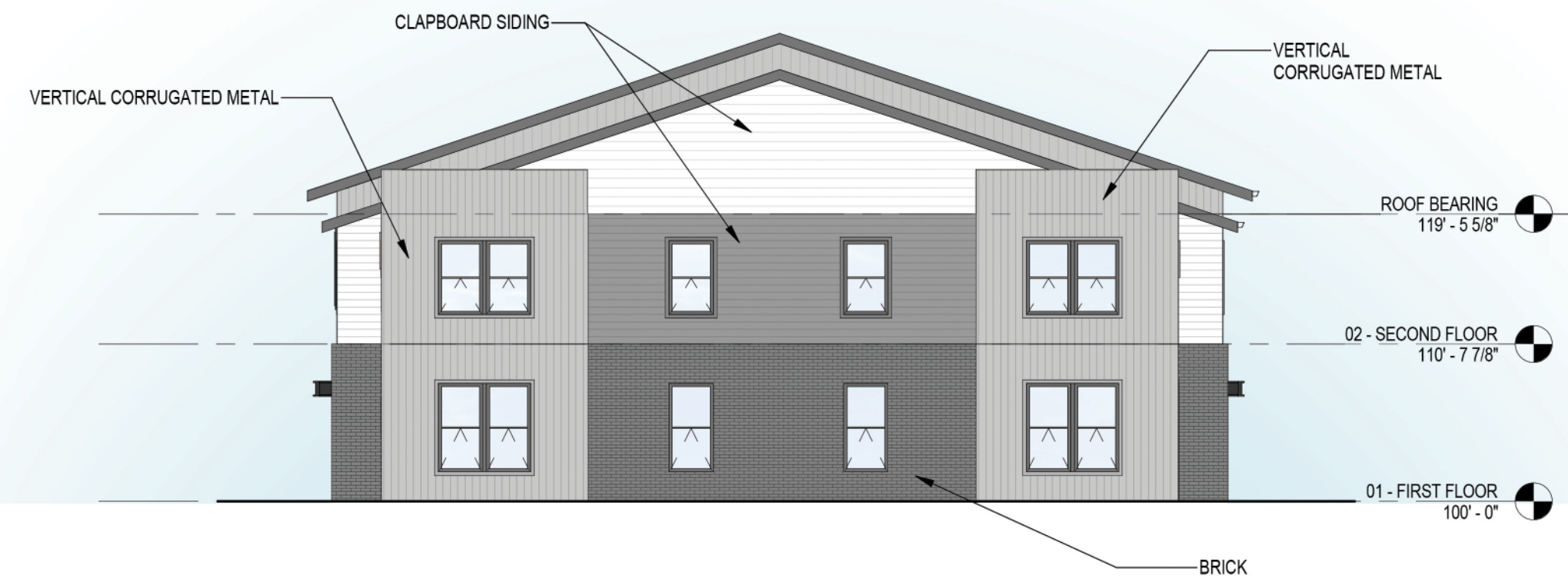
3 WEST ELEVATION 1" = 10'-0"