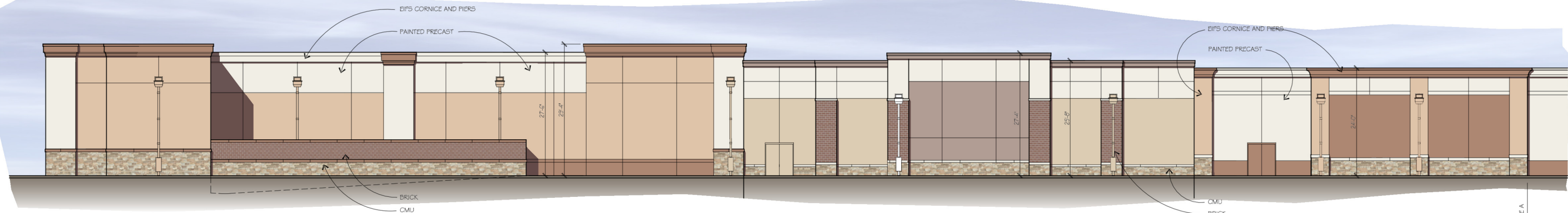
PARTIAL EAST ELEVATION 1 SCALE: 3/32"=1'-0" A4.3