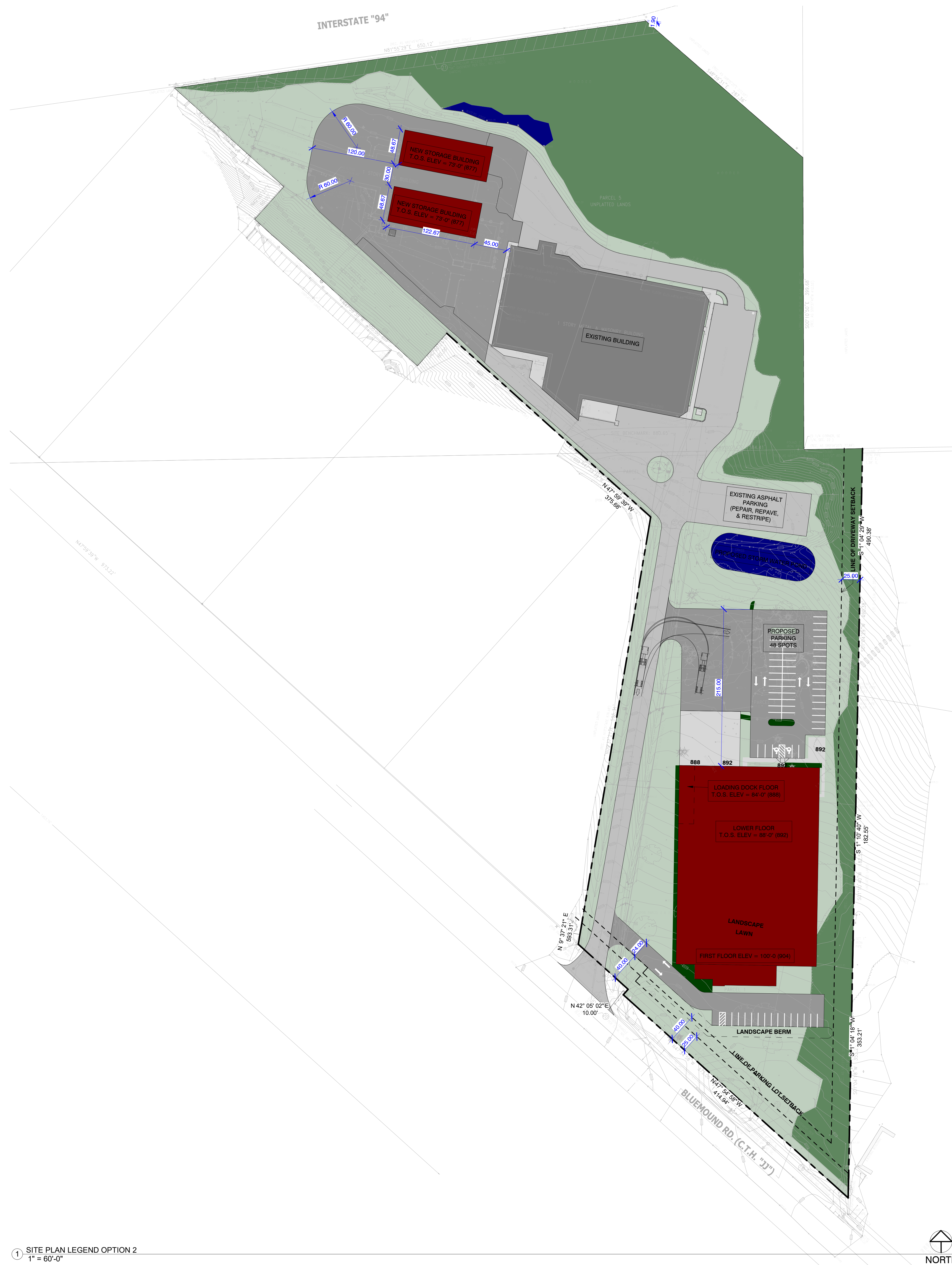
1 SITE PLAN LEGEND OPTION 2 1" = 60'-0"