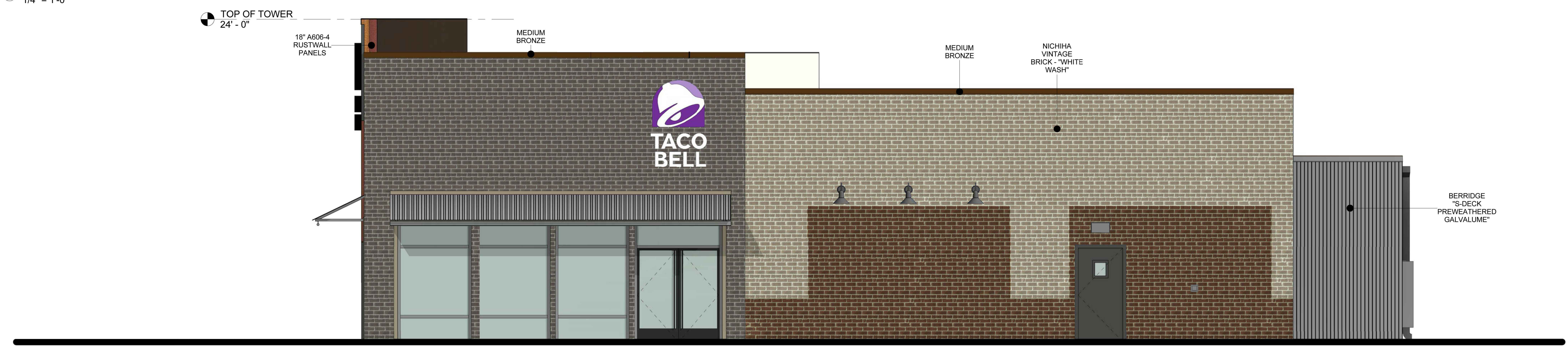
1 1/4" = 1'-0"