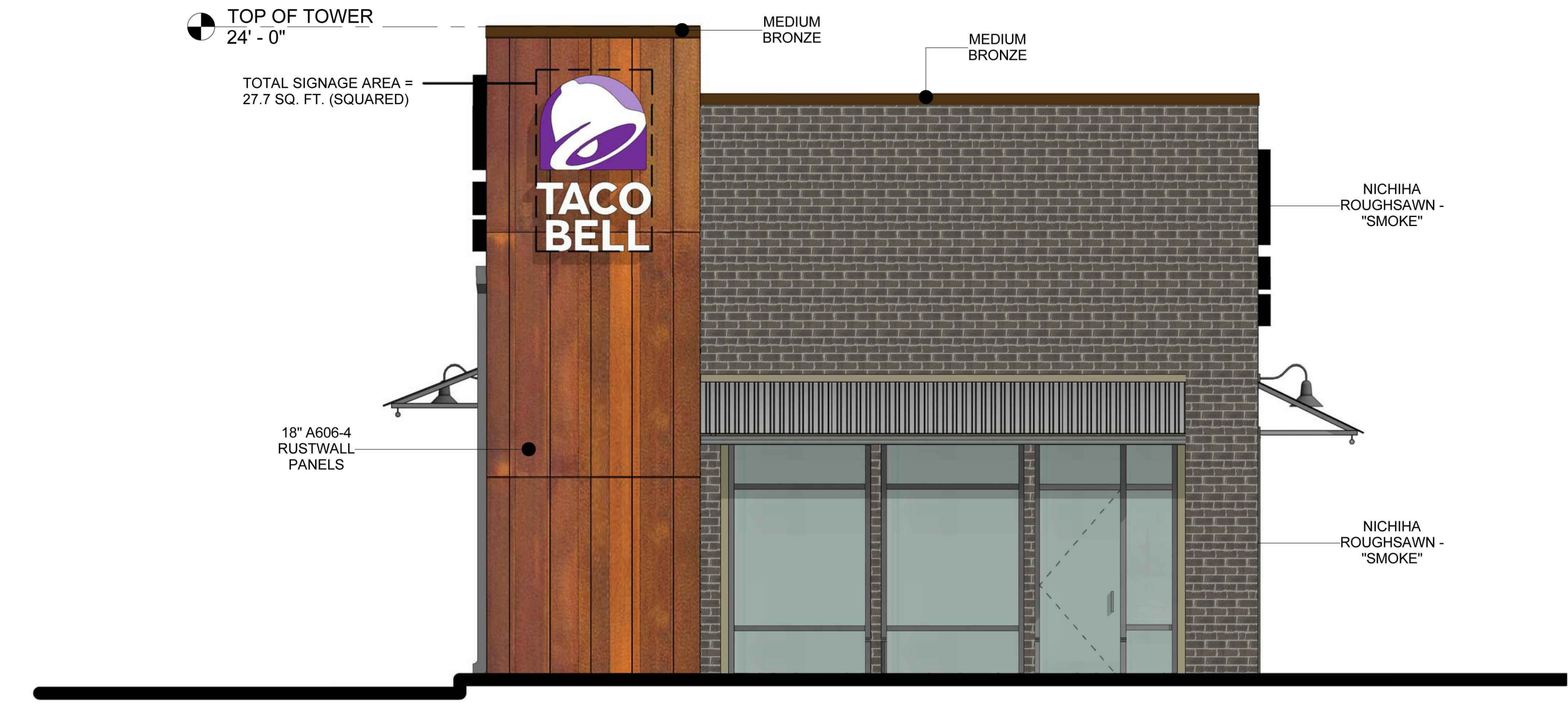
4 1/4" = 1'-0"