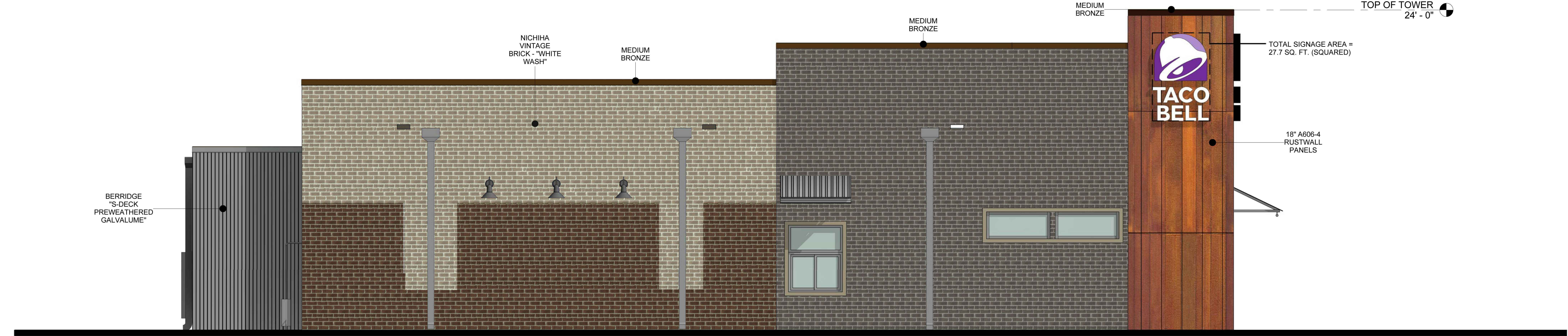
2 1/4" = 1'-0"