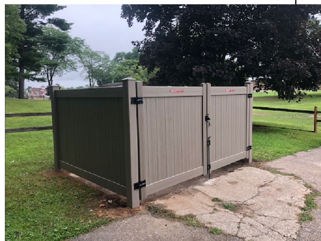
TRASH ENCLOSURE DESIGN INTENT SCALE: NTS