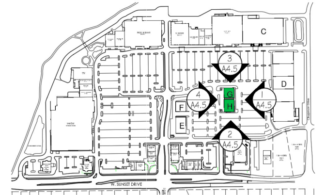
KEY PLAN SCALE: NTS