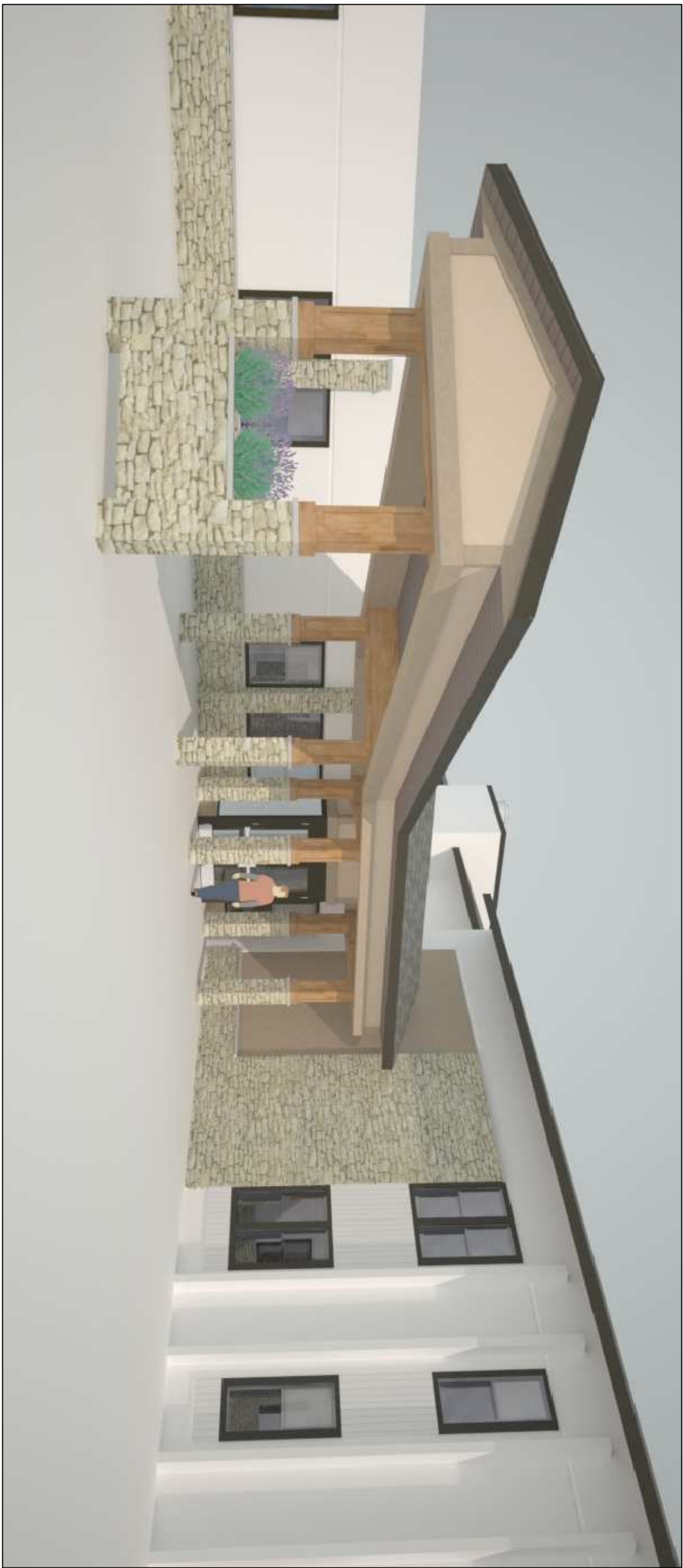
PROPOSED CLOSE-UP RENDERING