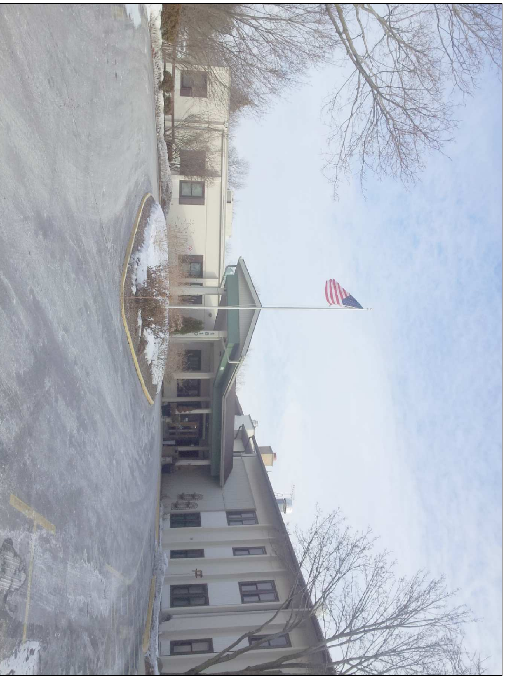
EXISTING FAR AWAY PHOTO