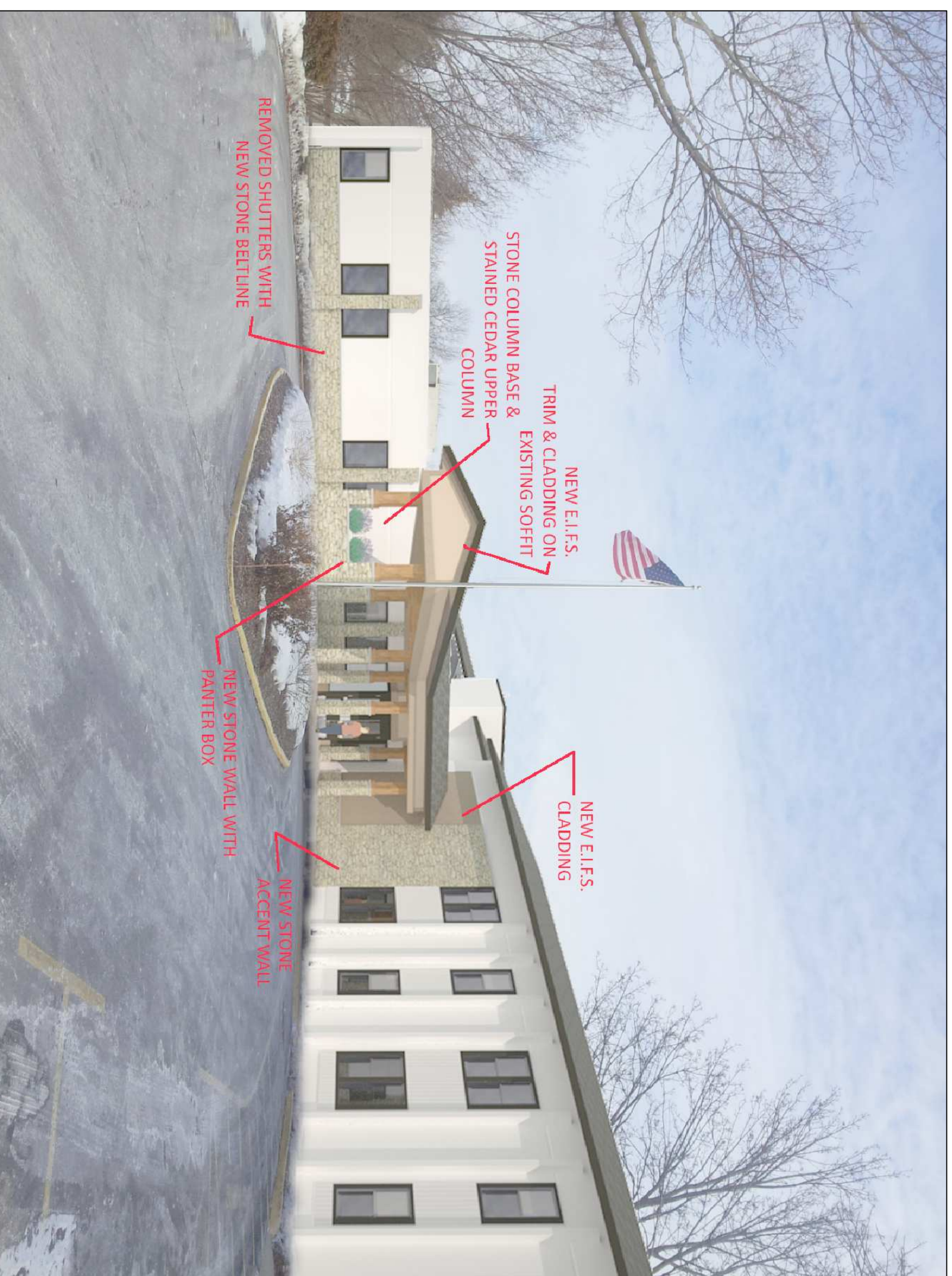
PROPOSED FAR AWAY RENDERING