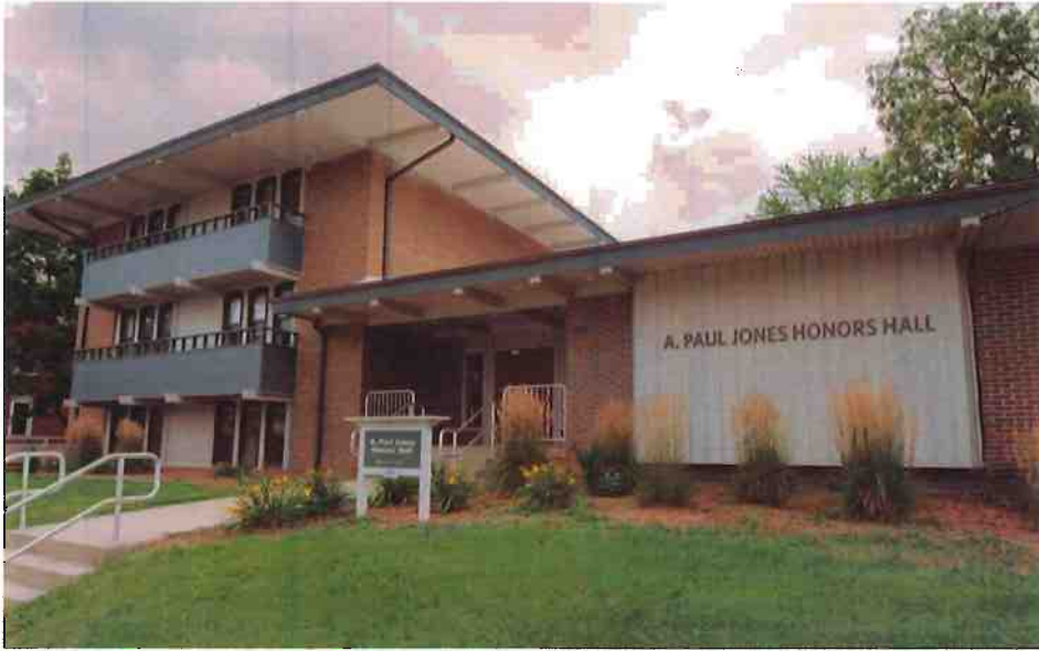
Picture 3: Proposed Building Name – A. Paul Jones Honors Hall Exterior Lettering: 11' Long x 6" High = 5.5 SF. Font: Whitney-semi bold Color: Grizzly Gray Matt