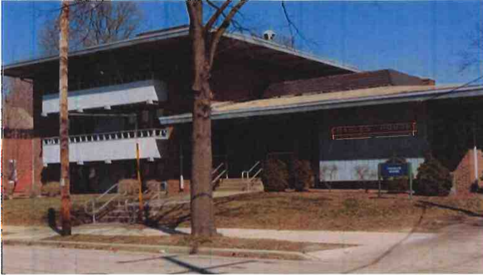
Picture 1: Charles House – September 2011: Note sign designating name of University Residence Hall. Original Sign Dimension: 10' 5" Long x 1' 1" Tall = 10.99 SF