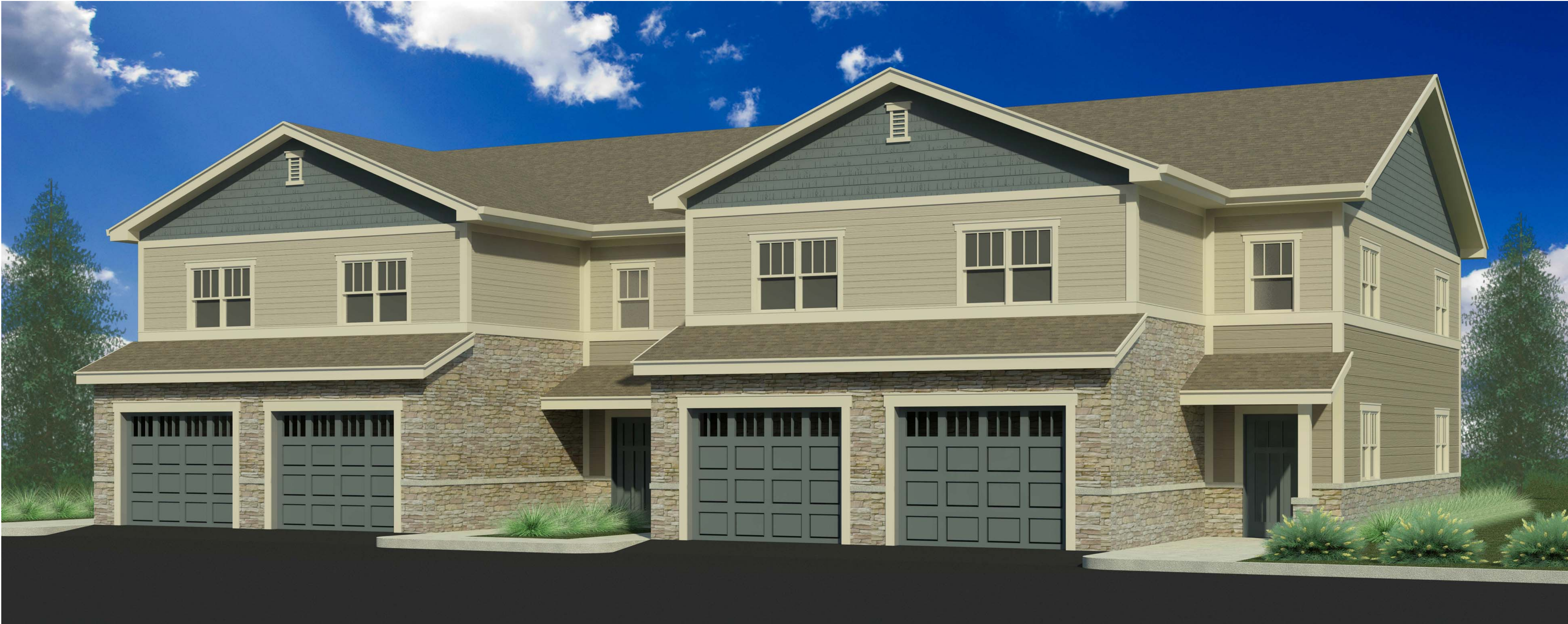
TOWNHOME - COLOR 'A' (BLUE)