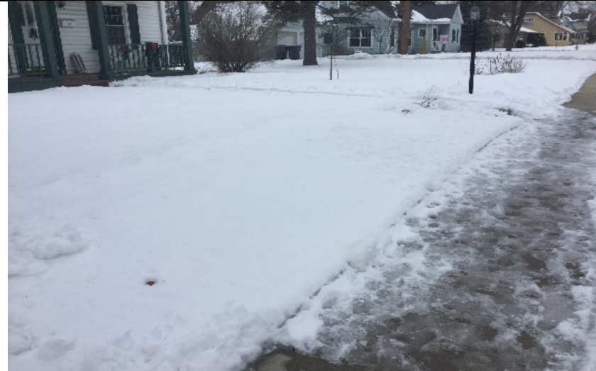
Figure 2 - Initial Inspection (2) 1/29/2020