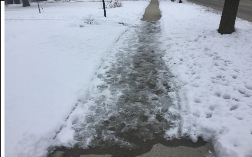
Figure 1 - Initial Inspection 1/29/2020