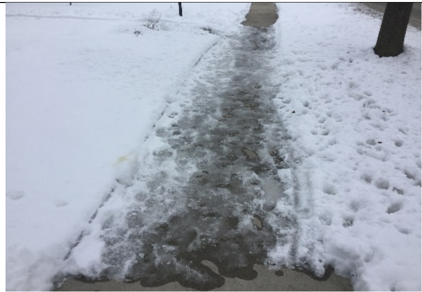
Figure 4 - Reinspection (1) 1/30/2020