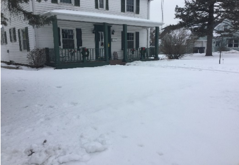
Figure 5- Reinspection (2) 1/30/2020