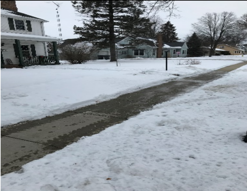
Figure 7 - AFTER CLEARING 1/30/2020