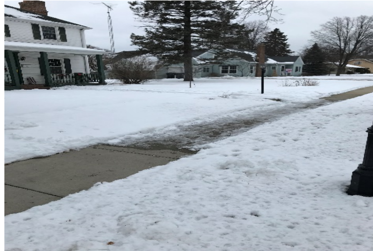
Figure 6- BEFORE CLEARING 1/30/2020