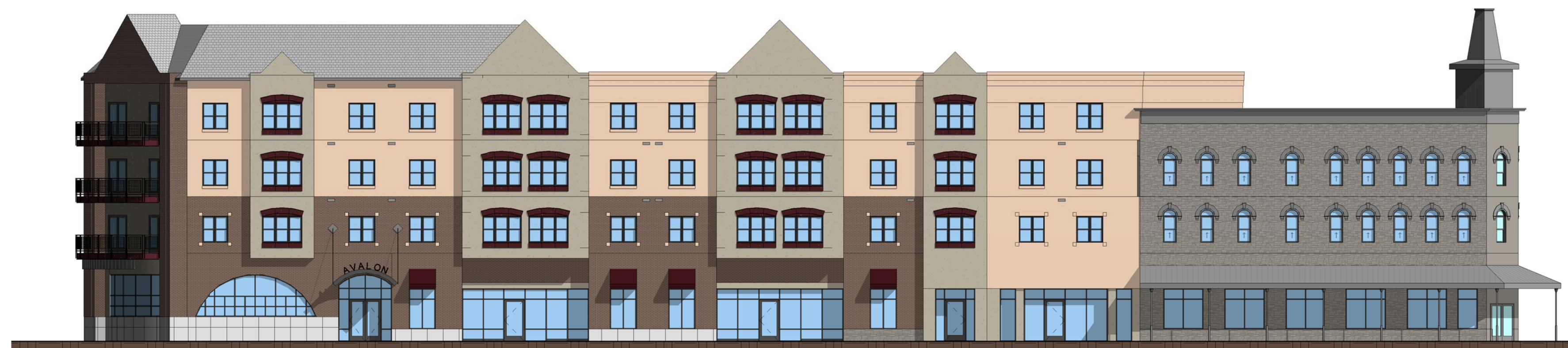
1A W. MAIN STREET - AFTER A210 1/16" = 1'-0"