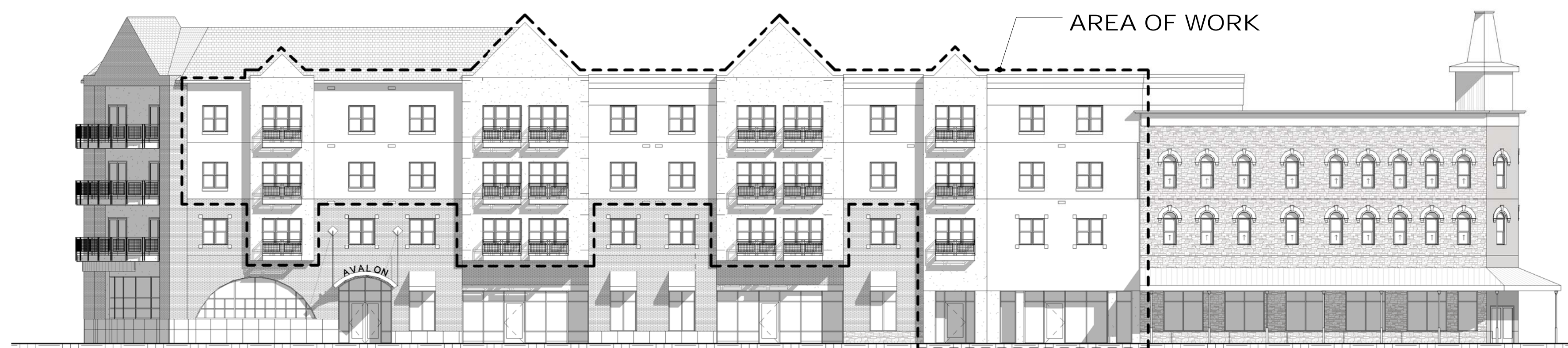
1B W. MAIN STREET - BEFORE A210 1/16" = 1'-0"