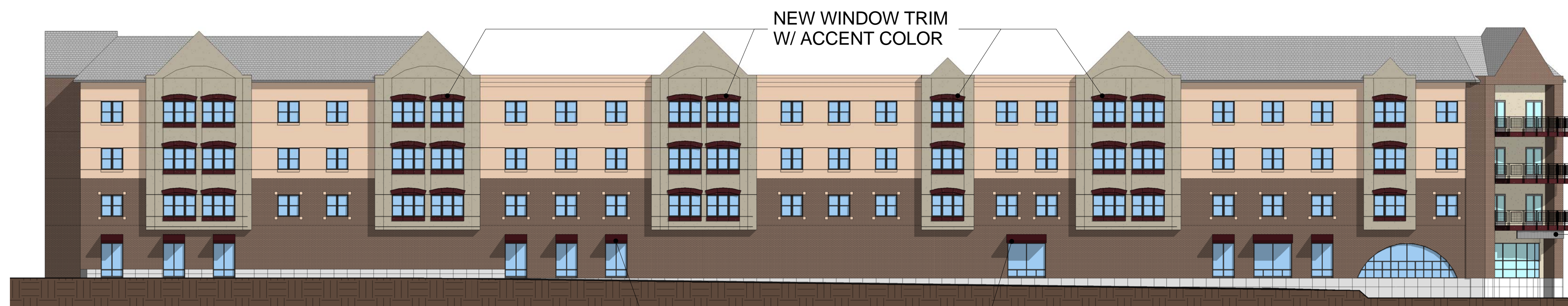
2A N. BARSTOW STREET - AFTER A210 1/16" = 1'-0"