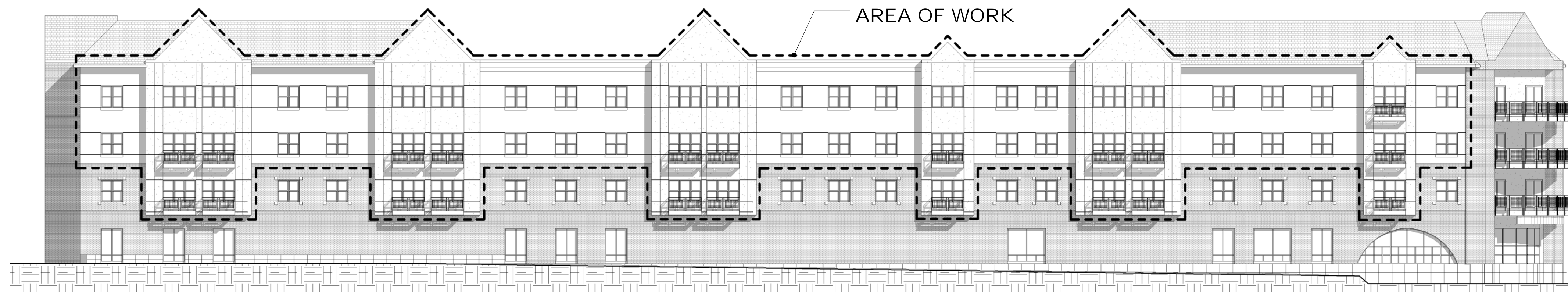
2B N. BARSTOW STREET - BEFORE A210 1/16" = 1'-0"