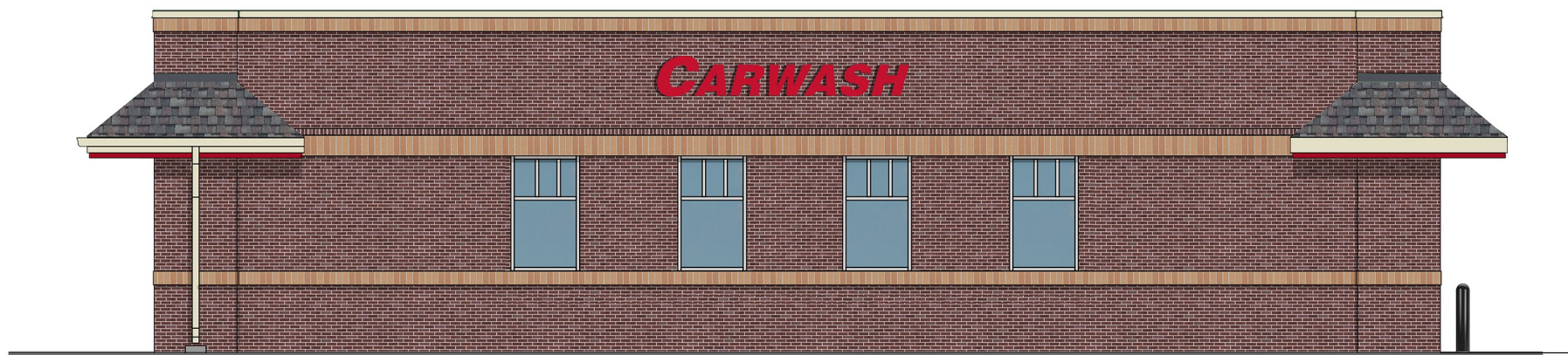
4 RIGHT ELEVATION