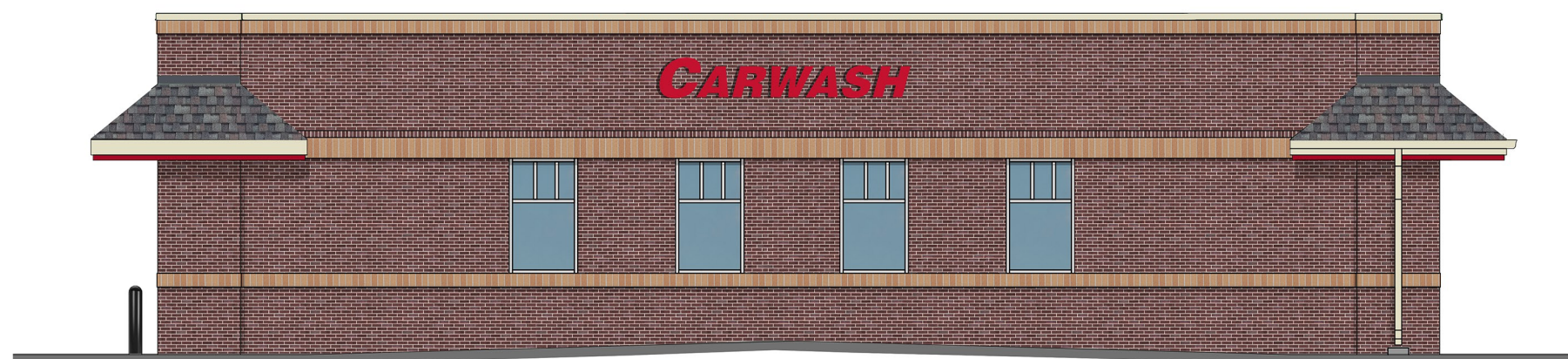
2 LEFT ELEVATION