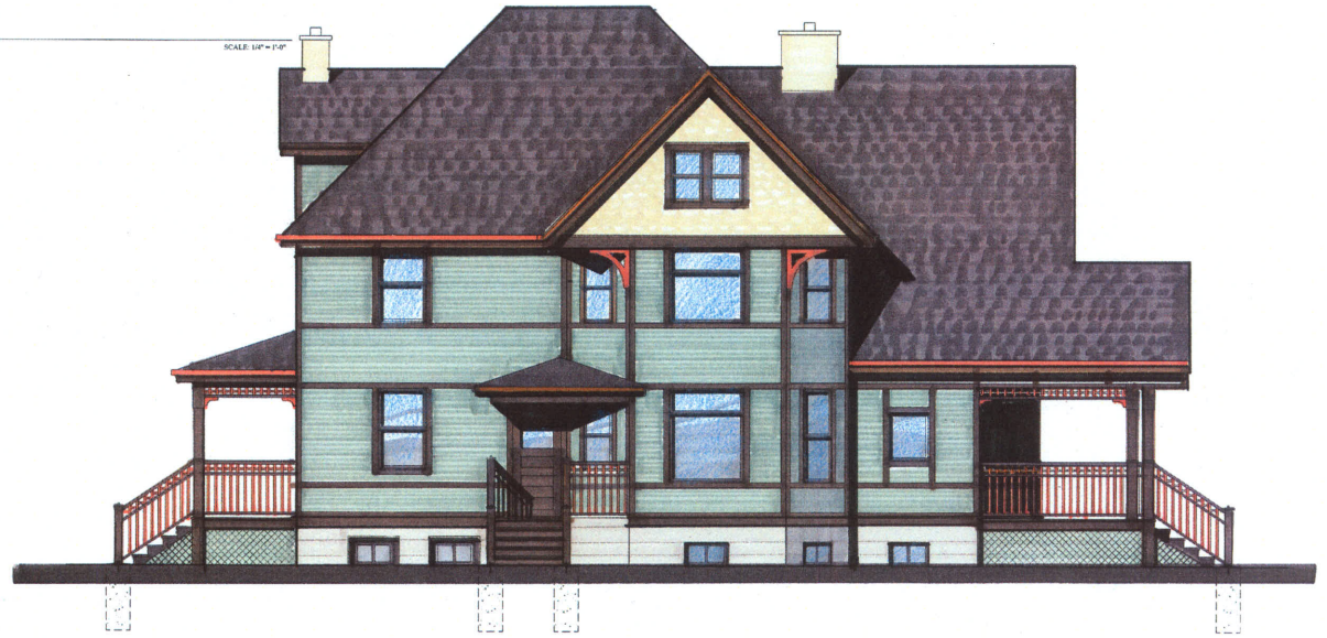
2 PROPOSED NEW EAST ELEVATION