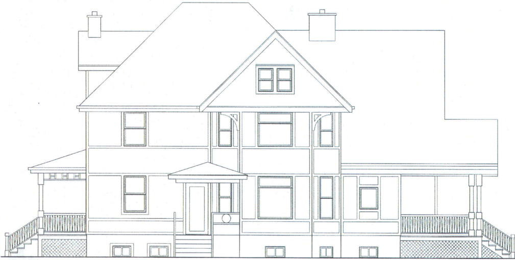
1 EXISTING EAST ELEVATION