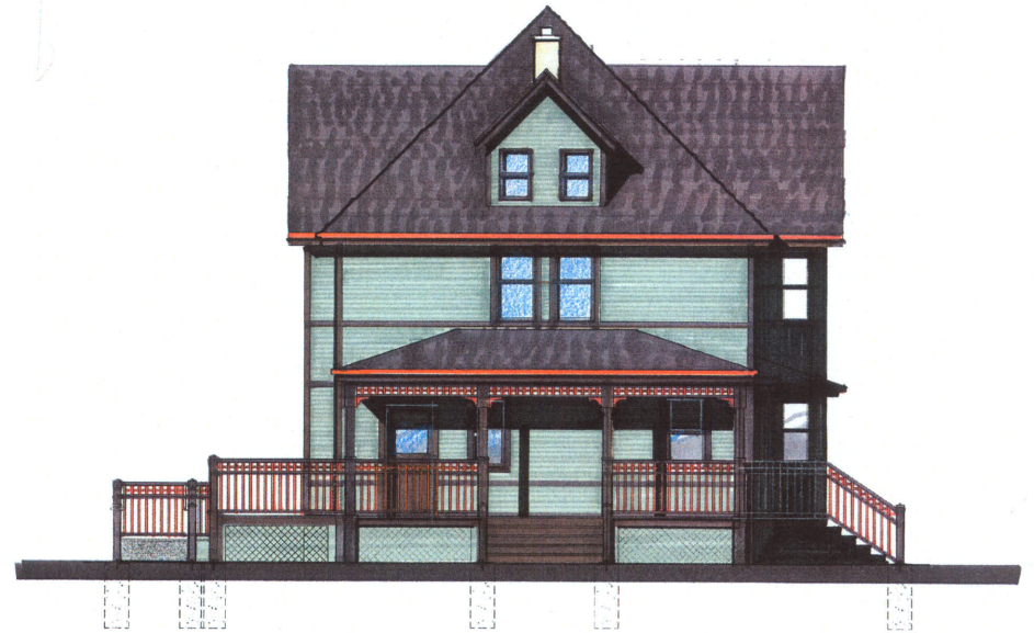
2 PROPOSED NEW SOUTH ELEVATION