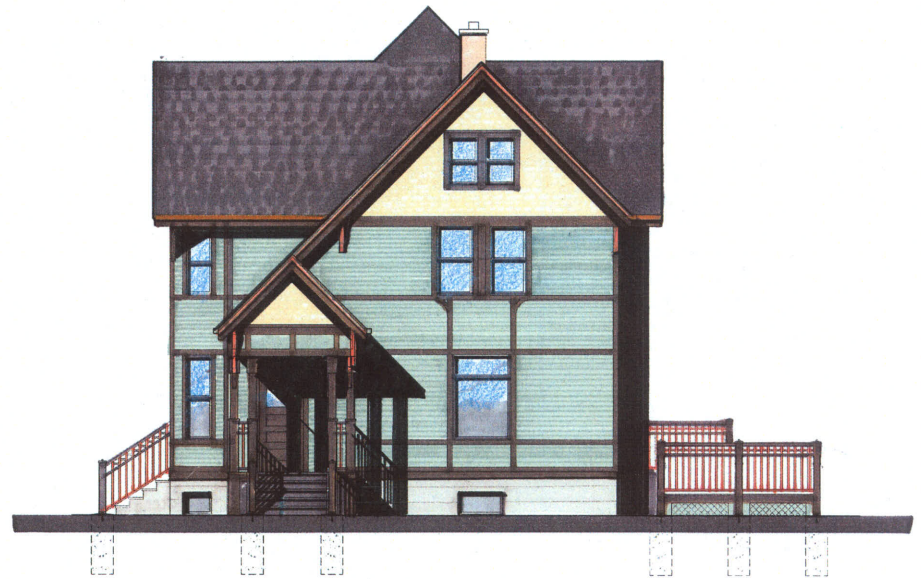
2 PROPOSED NEW NORTH ELEVATION