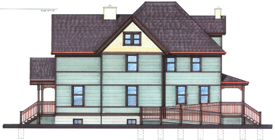
2 PROPOSED NEW WEST ELEVATION