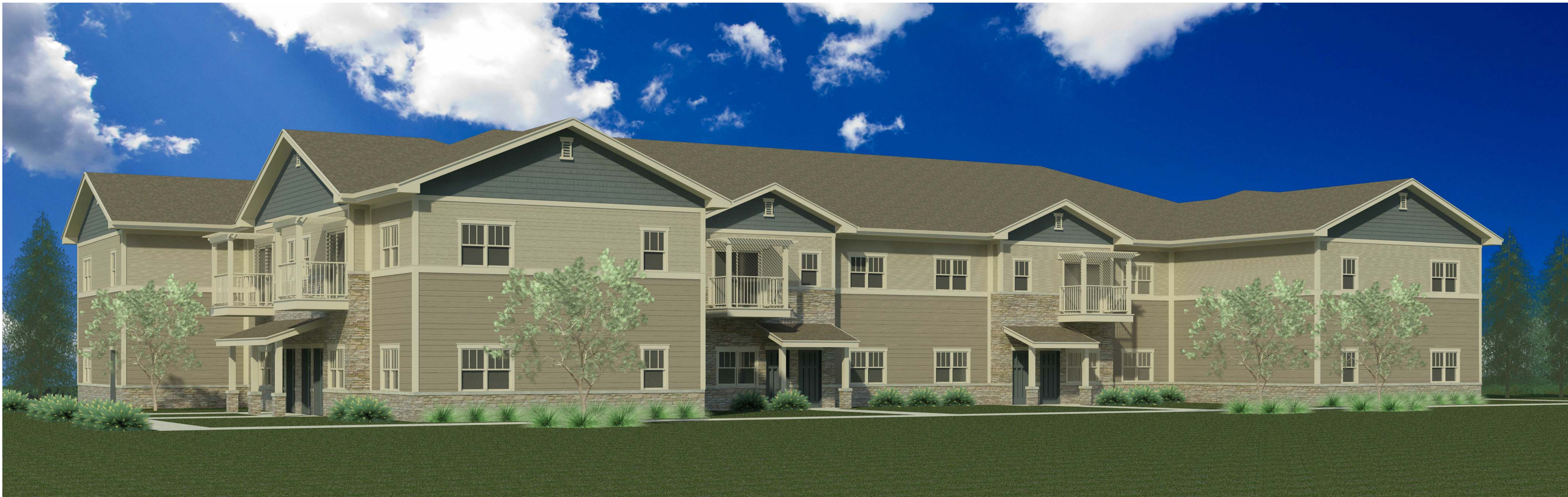
APARTMENT REAR - BUILDING B (BLUE)