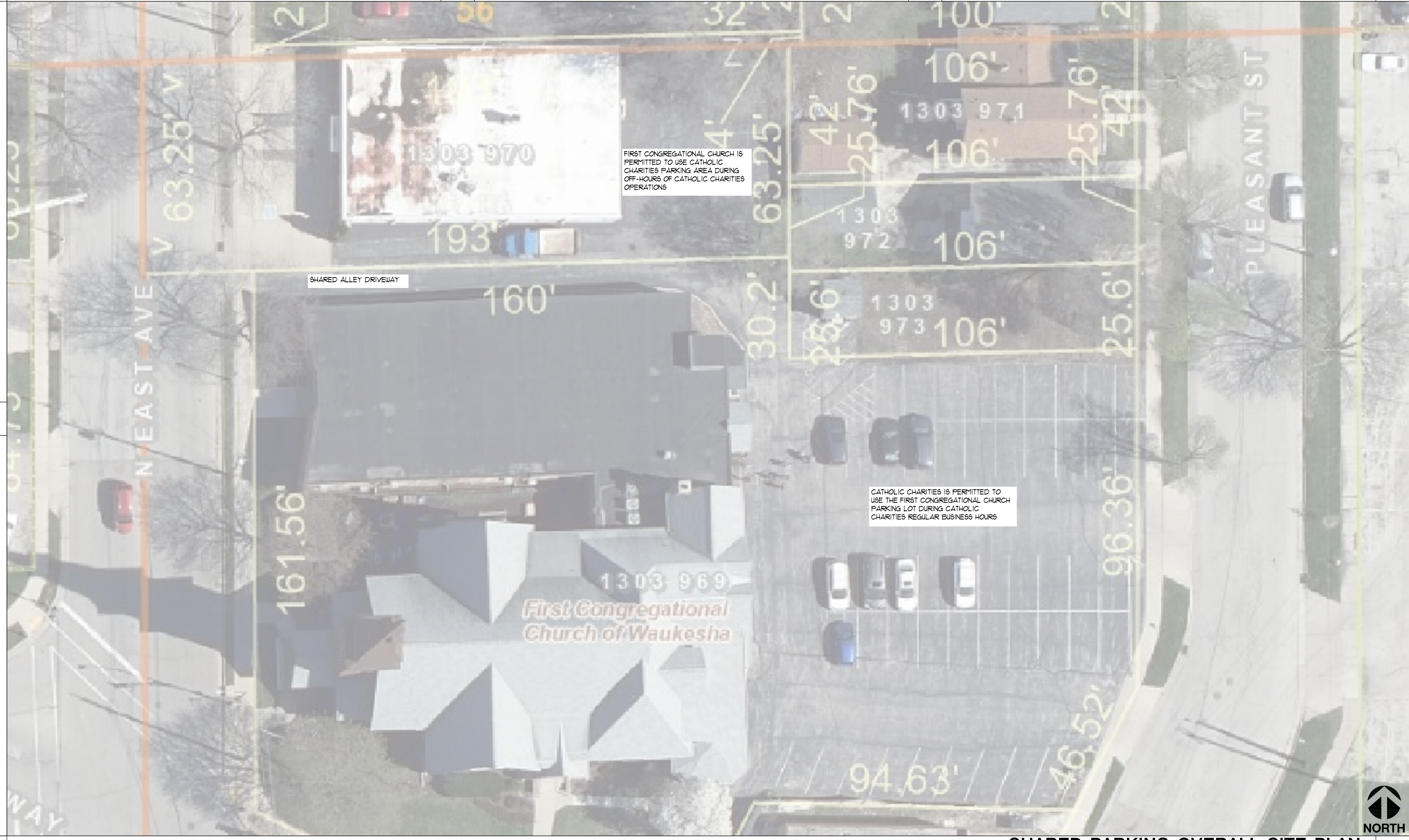
SHARED PARKING OVERALL SITE PLAN 1 1" = 20' - 0"