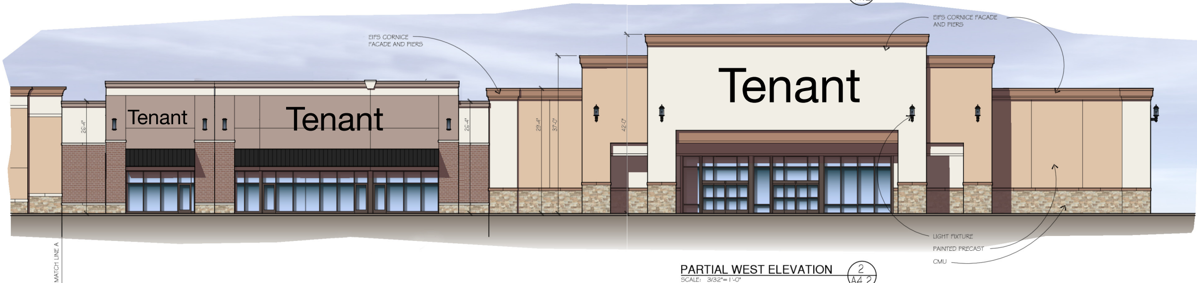
PARTIAL WEST ELEVATION 2 SCALE: 3/32"=1'-0"