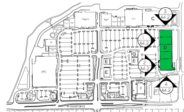
KEY PLAN SCALE: NTS