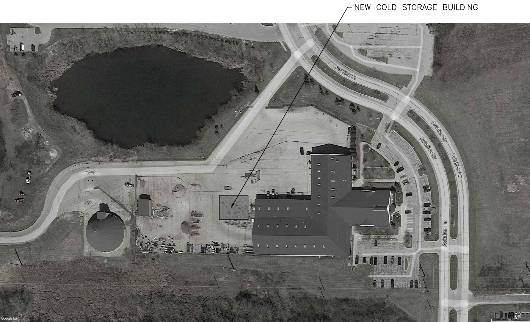
SITE PLAN SCALE: N.T.S.