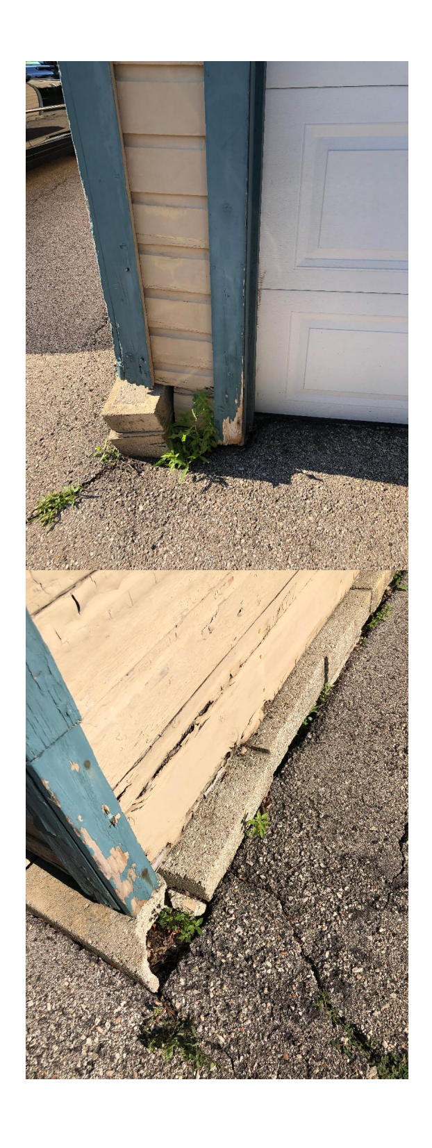
Sent from the all new AOL app for iOS