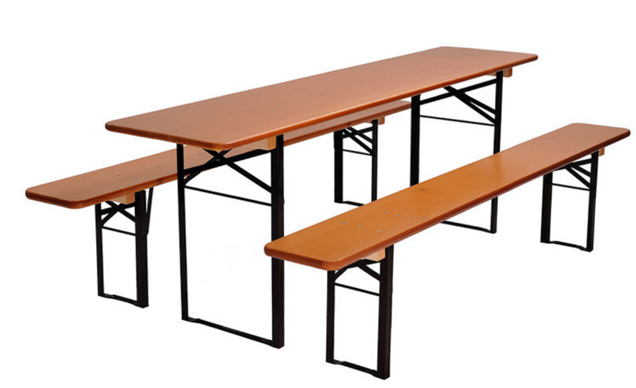
BEER GARDEN TABLE (LARGE)