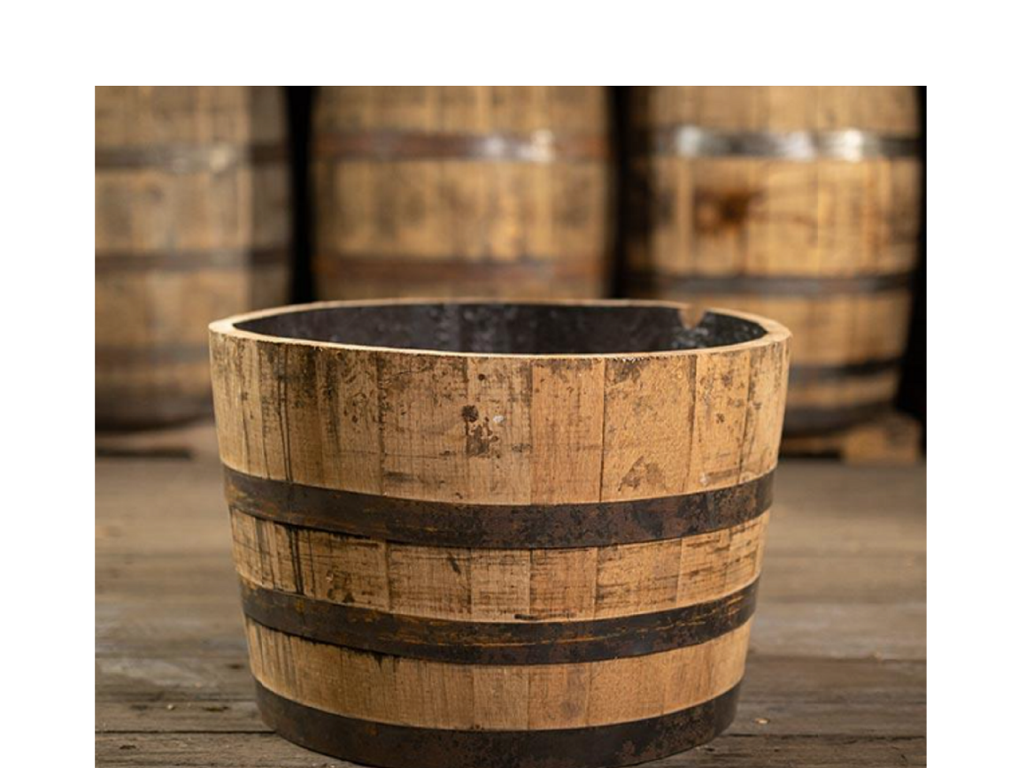
HALF WHISKEY BARREL PLANTER