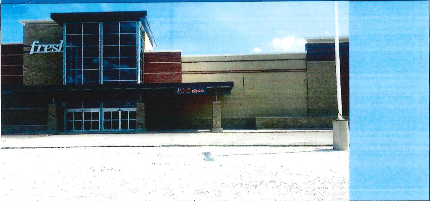
Picture of left side of building