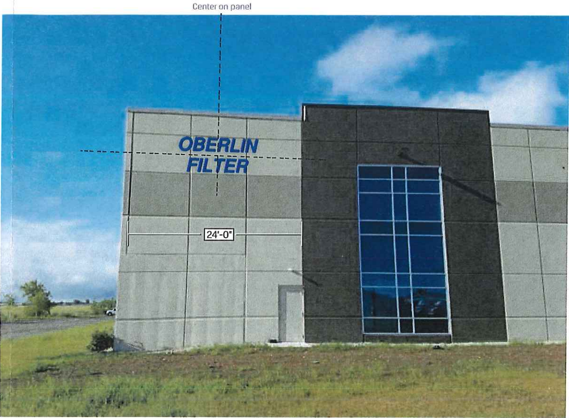
Proposed - North Elevation - NTS