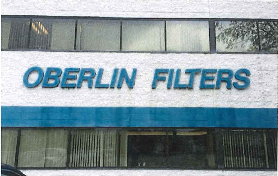
Existing letters - old location - NTS