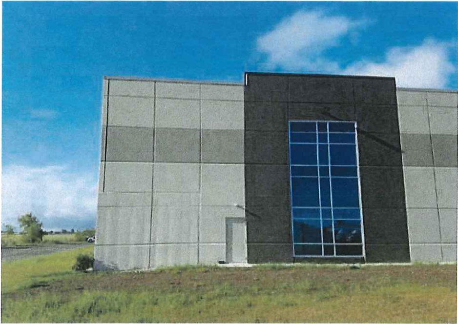
Existing wall - new location - NTS

Rework Method: Remove existing non-lit letters (from Waukesha location), clean and paint to match 7725-37 Sapphire Blue, install as shown in Pewaukee location