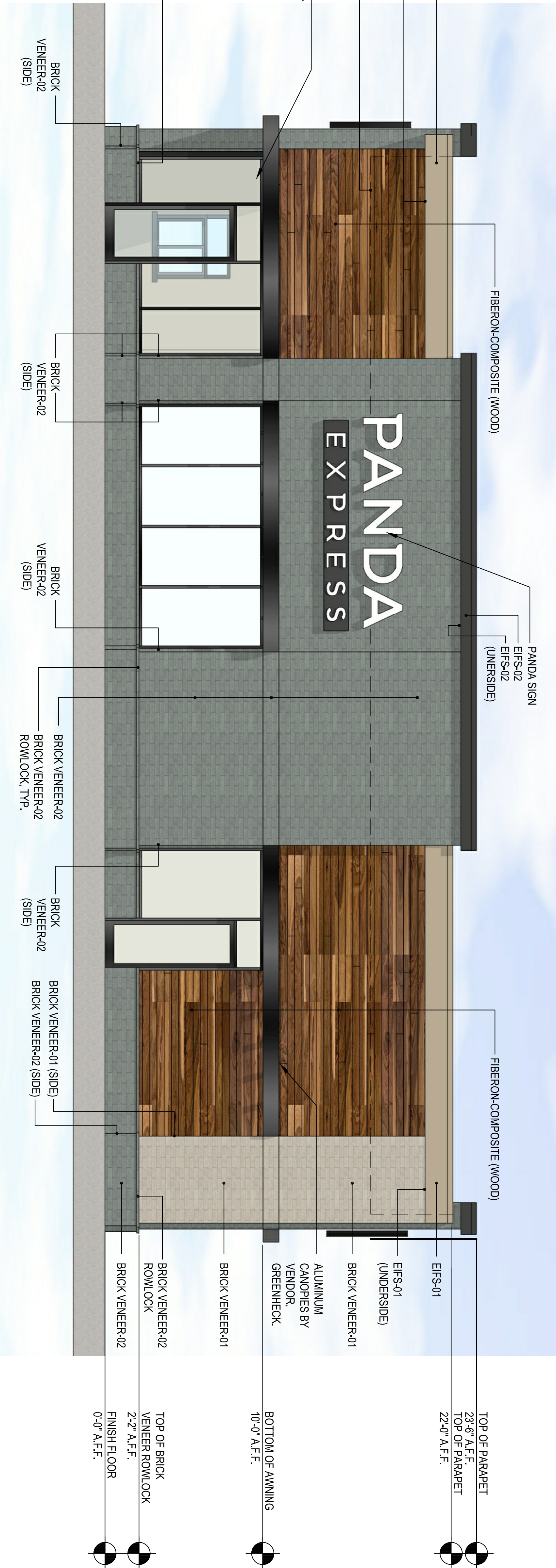
EAST ELEVATION 2