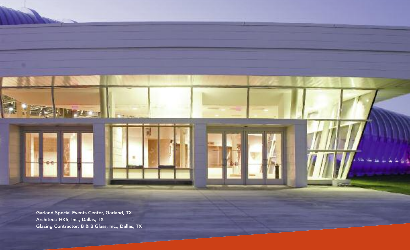
Garland Special Events Center, Garland, TX Architect: HKS, Inc., Dallas, TX Glazing Contractor: B & B Glass, Inc., Dallas, TX

Single Source Packages Generate Versatile First Impressions