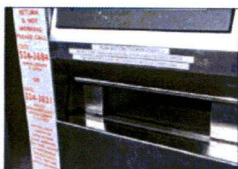
The book return at the Waukesha Public Library in December 2015.