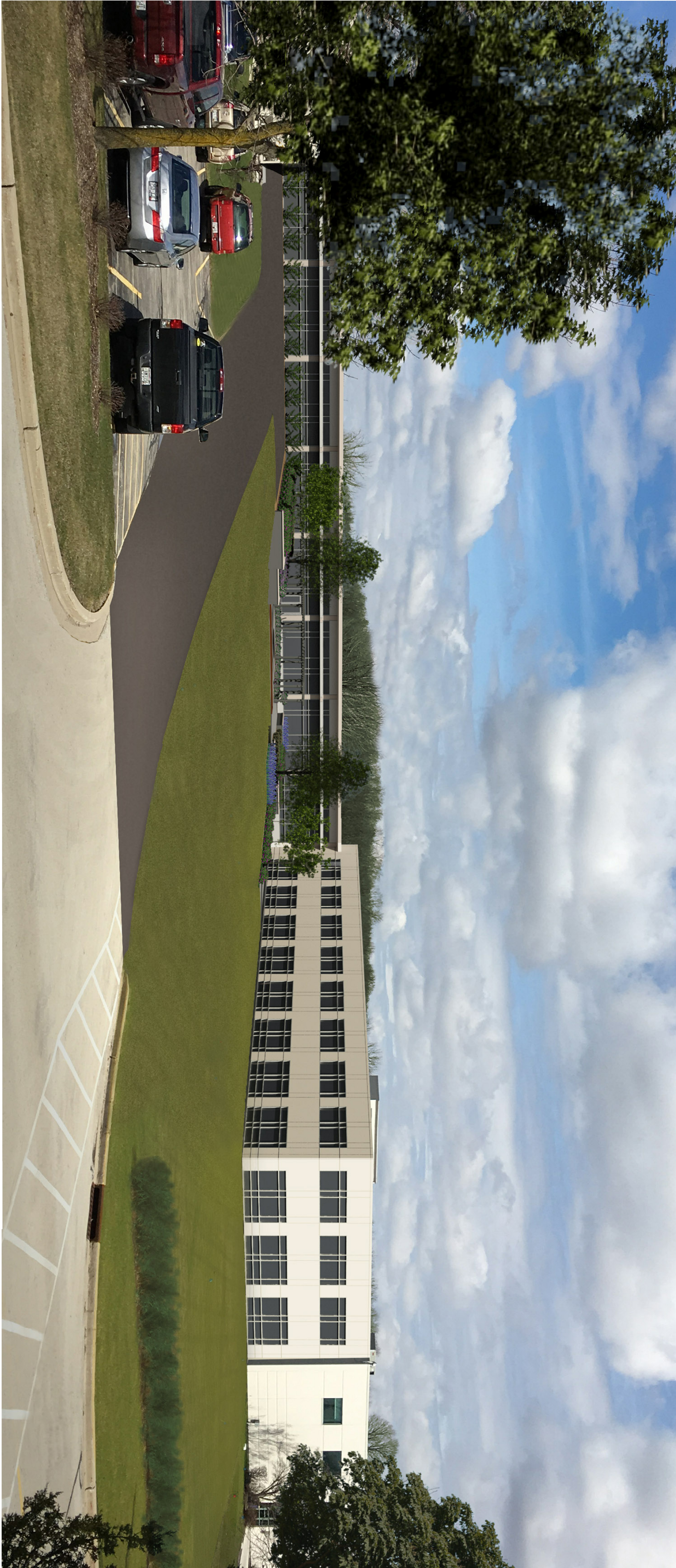
3 RENDERING OF ELEVATIONS AT COURTYARD AREA