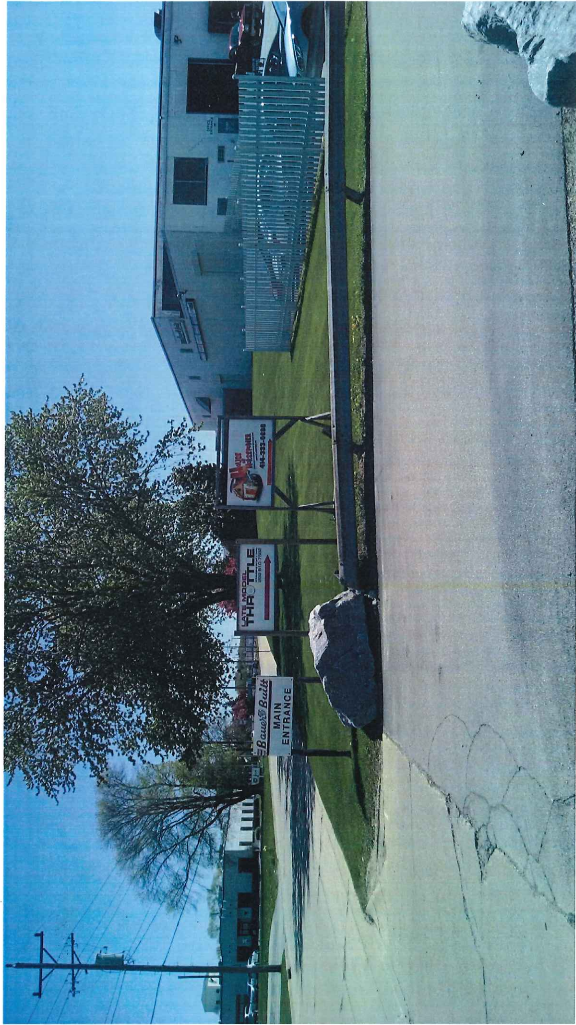
Existing Signs To Be Removed - 3-wooden Entrance Signs