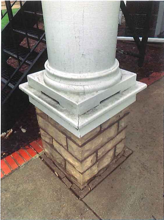
Example of how these columns should be constructed.