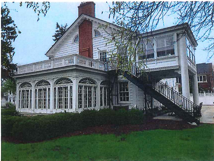
SW 7757 High Reflective White