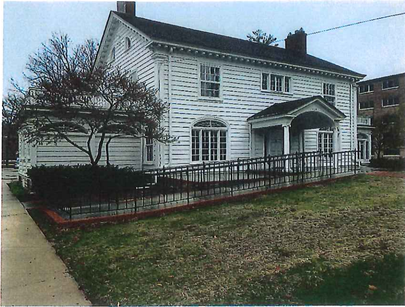
Exterior Paint Color: SW 7757 High Reflective White