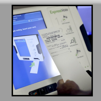
Utilized new ballot marker during in-person absentee voting which helped keep the costs of ballots down and reduced time on Election Day processing ballots