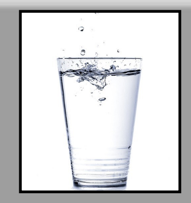
Received authorization to move forward in WIFIA process which will provide low-cost federal loans for the water project and help ensure the lowest possible costs for ratepayers