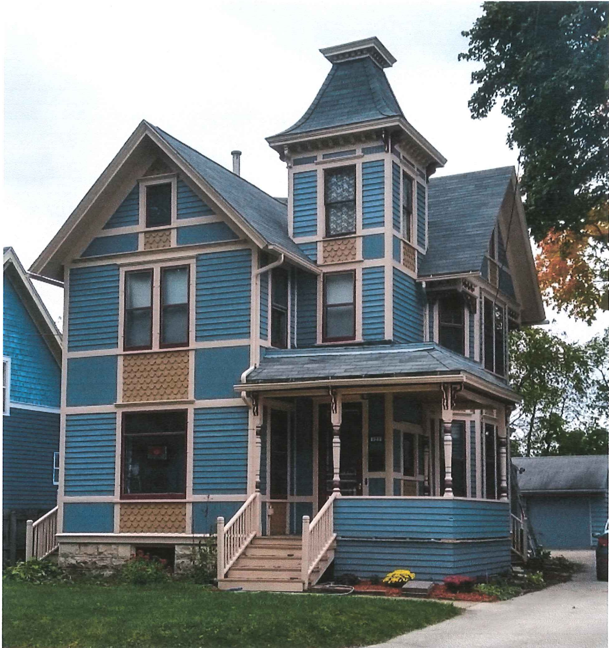
Existing porch conditions.