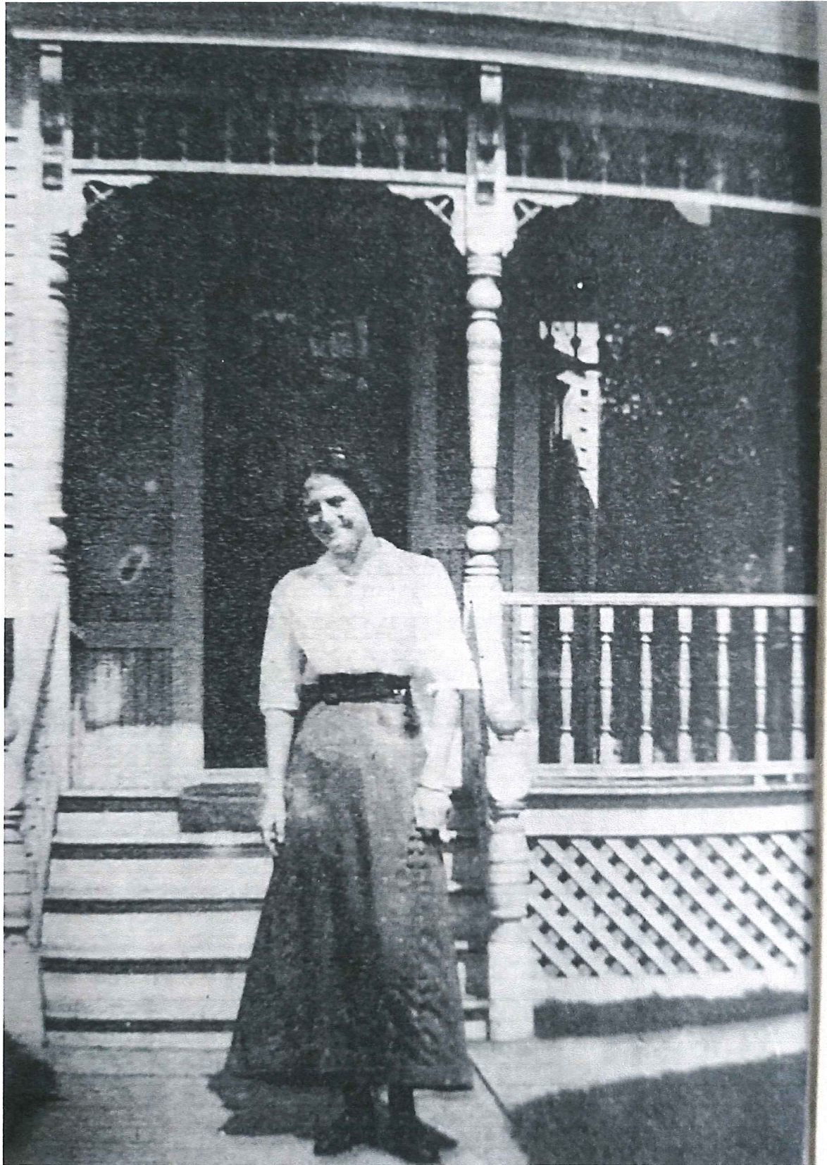
Original front porch about 1917.