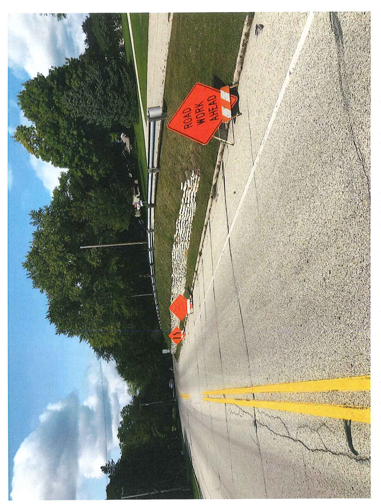
Work Ahead signs on Broadway, approximately 600 feet East of the work zone.