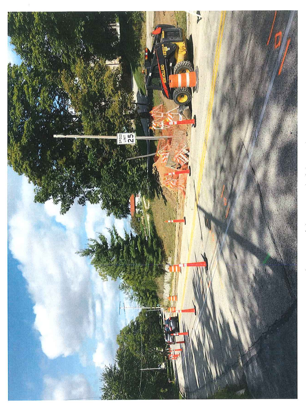
Another view of the east end of the work zone