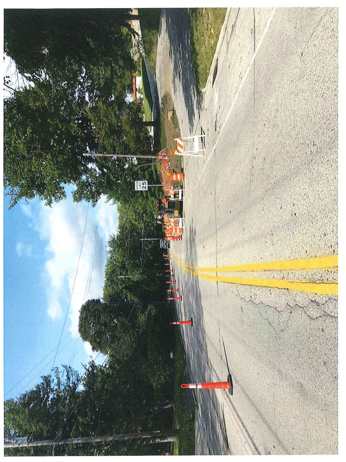
East end of the beginning of the work zone looking East. Following the accident(s), the skid loader was moved to this end to better protect and highlight the work area.