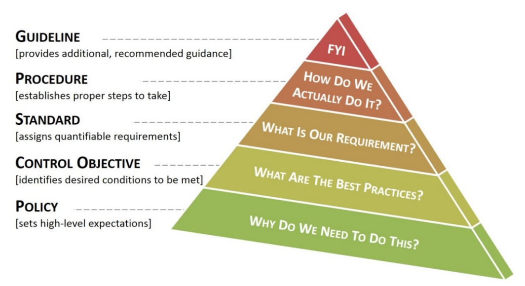
Figure 1: Policy Framework