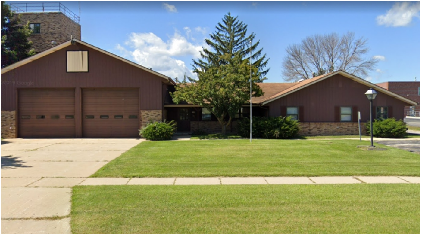
The current Fire Station location on Sentry Drive prior to construction.