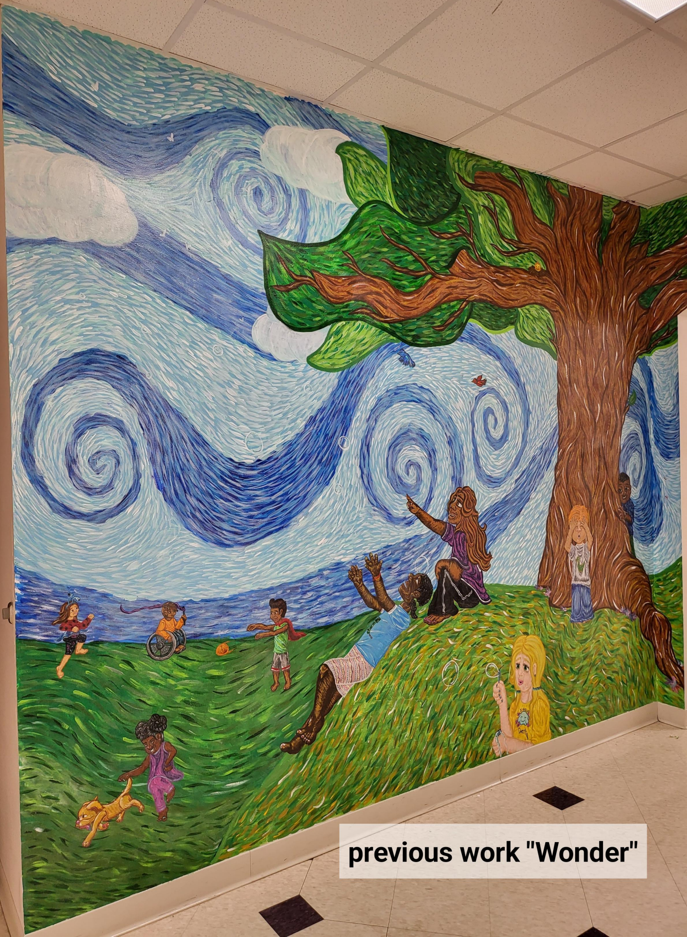
previous work "Wonder"