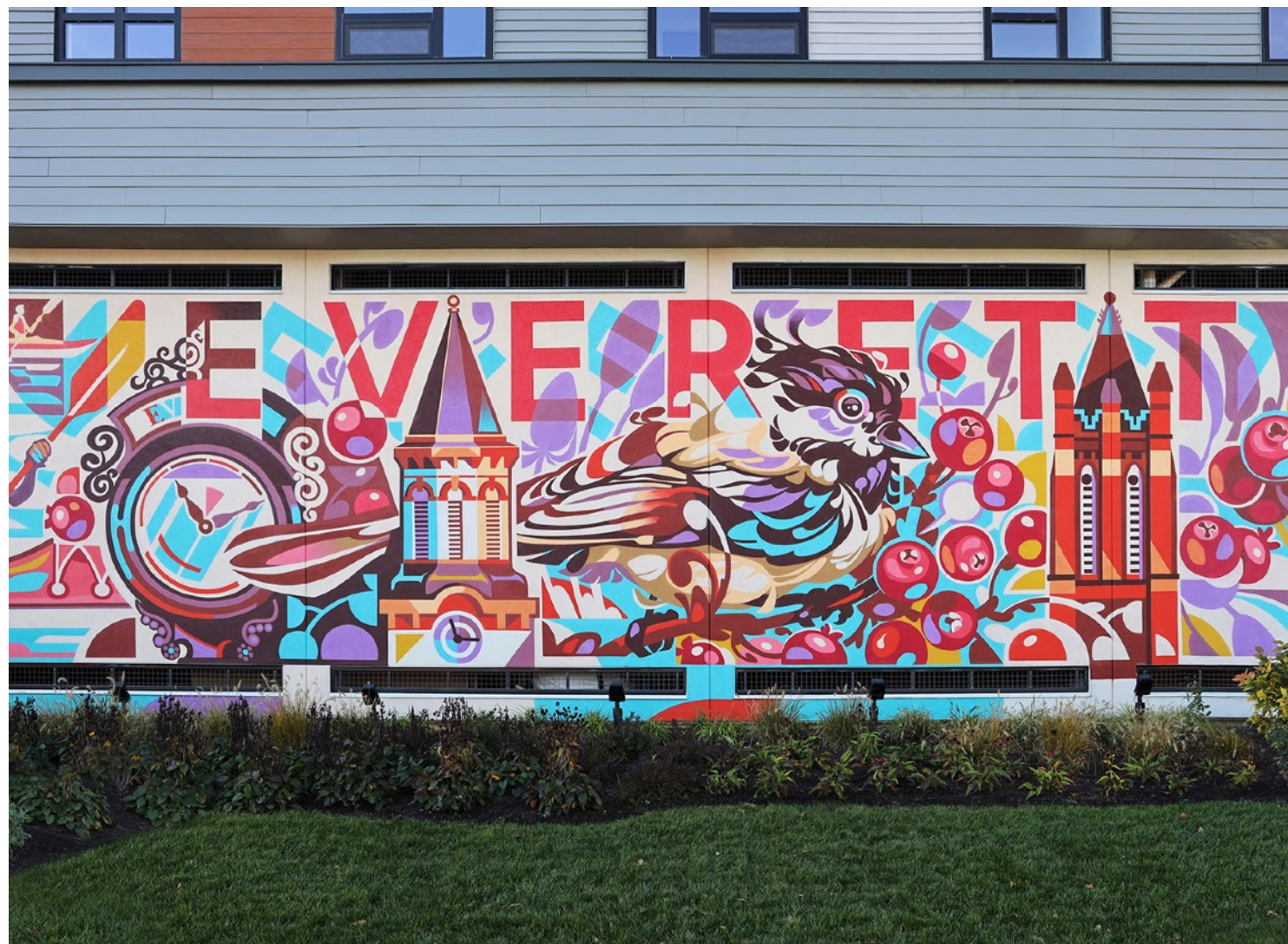
“EVERETT” PROJECT: PARADE ART, ANTHEM BUILDING LOCATION: EVERETT, MA, USA DIMENSIONS: 16 FT H × 114 FT W YEAR: 2024 BUDGET: $50,000 ROLE: LEAD ARTIST ANDREY KRAVTSOV