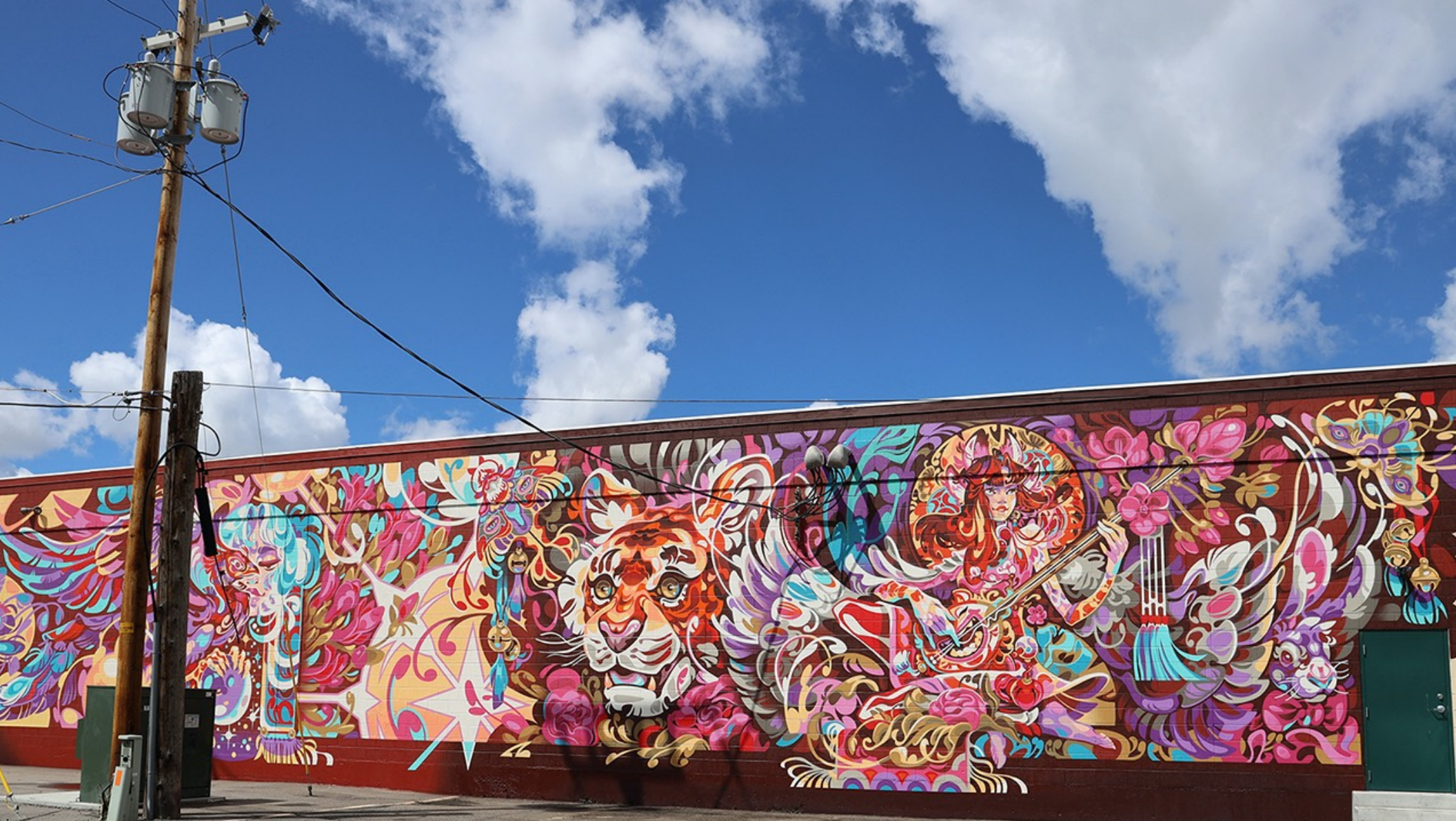
"FANTASY TALE" PROJECT: MURAL FEST AND SOUTH SALT LAKE ARTS LOCATION: SOUTH SALT LAKE, UT, US DIMENSIONS: 15 FT H x 260 FT W YEAR: 2024 ROLE: LEAD ARTIST ANDREY KRAVTSOV