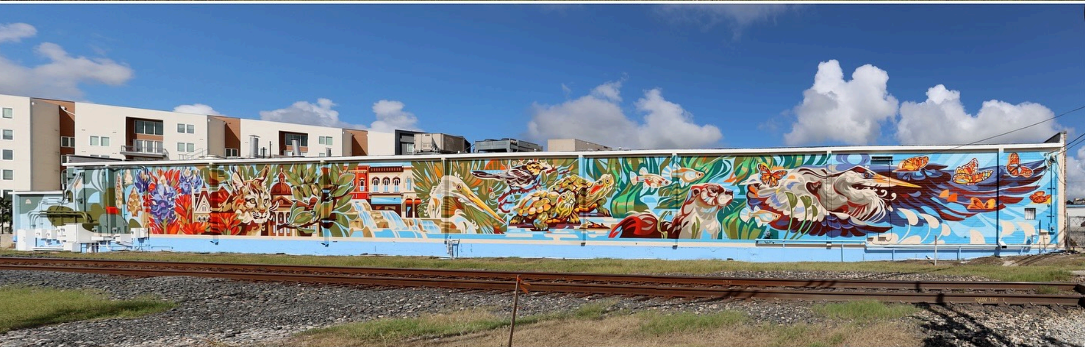
“FLOWING THROUGH SAN MARCOS” PROJECT: GATEWAY MURAL LOCATION: SAN MARCOS, TX,US DIMENSIONS: 200 FT W × 20 FT H YEAR: 2024 BUDGET: $80,000 ROLE: LEAD ARTIST ANDREY KRAVTSOV