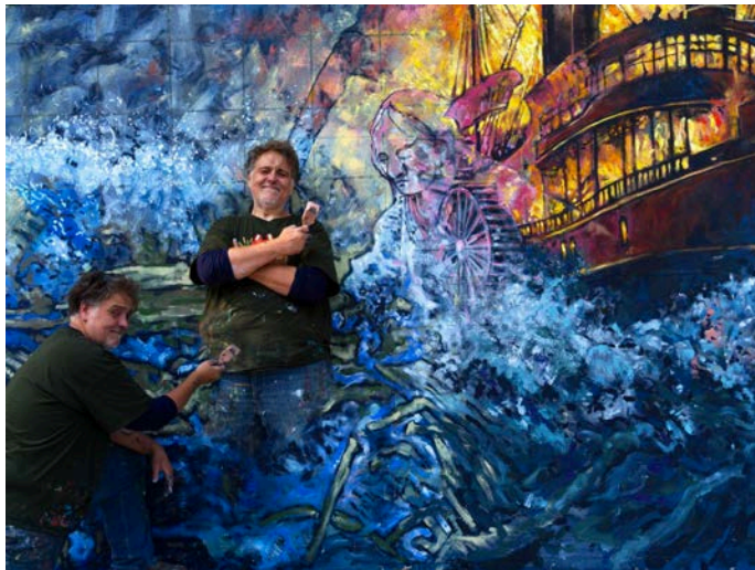
Port Washington 2025

https://www.youtube.com/watch?v=2N0E3b9zpEY