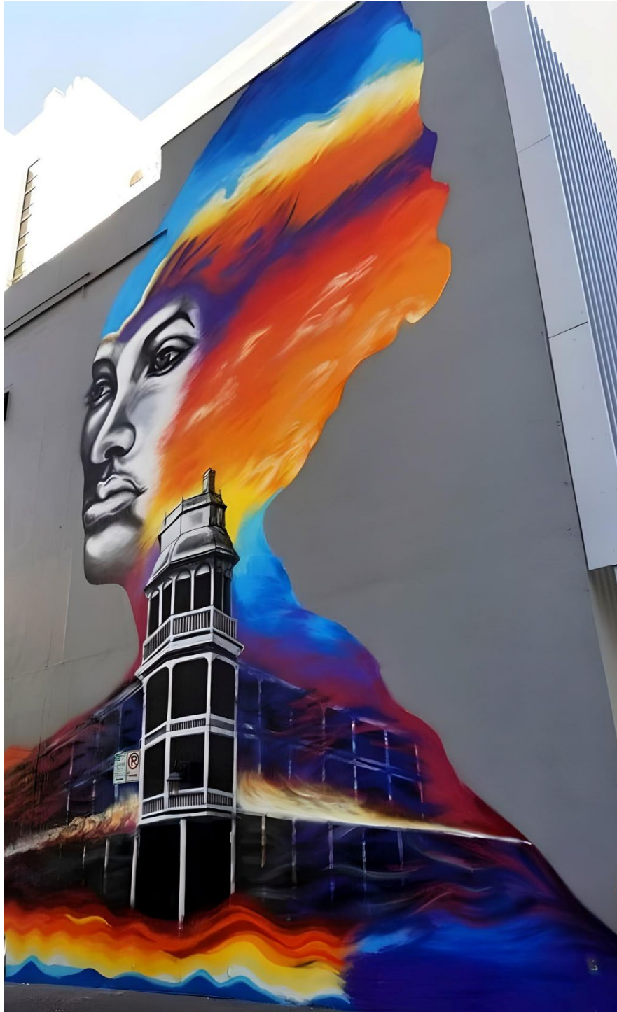
Renaissance Phoenix Downtown / Melinda's Alley, Phoenix, Arizona 50 feet x 74 feet, aerosol