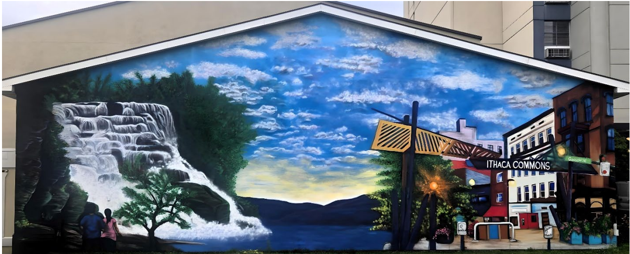
Hotel Ithaca, Ithaca, New York 30 feet x 50 feet, aerosol A gateway mural celebrating hospitality, local landmarks, and regional identity.