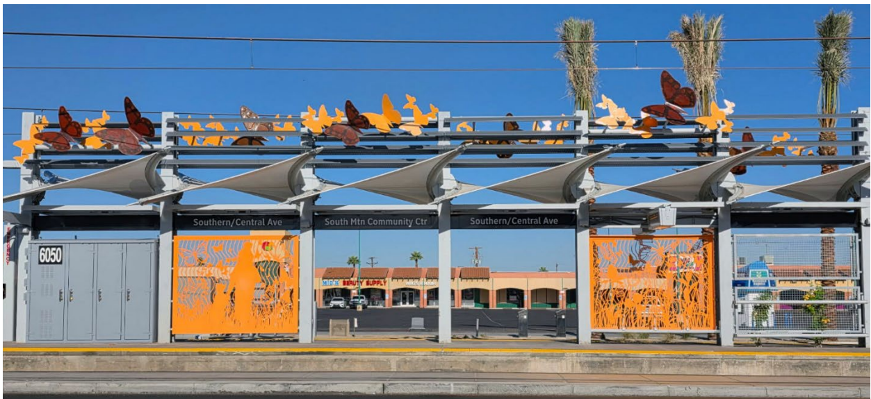
Southern Avenue Station, Phoenix, Arizona 280 feet x 18 feet, aerosol A large-scale transit mural celebrating children, family, and collective care through butterfly and garden symbolism.