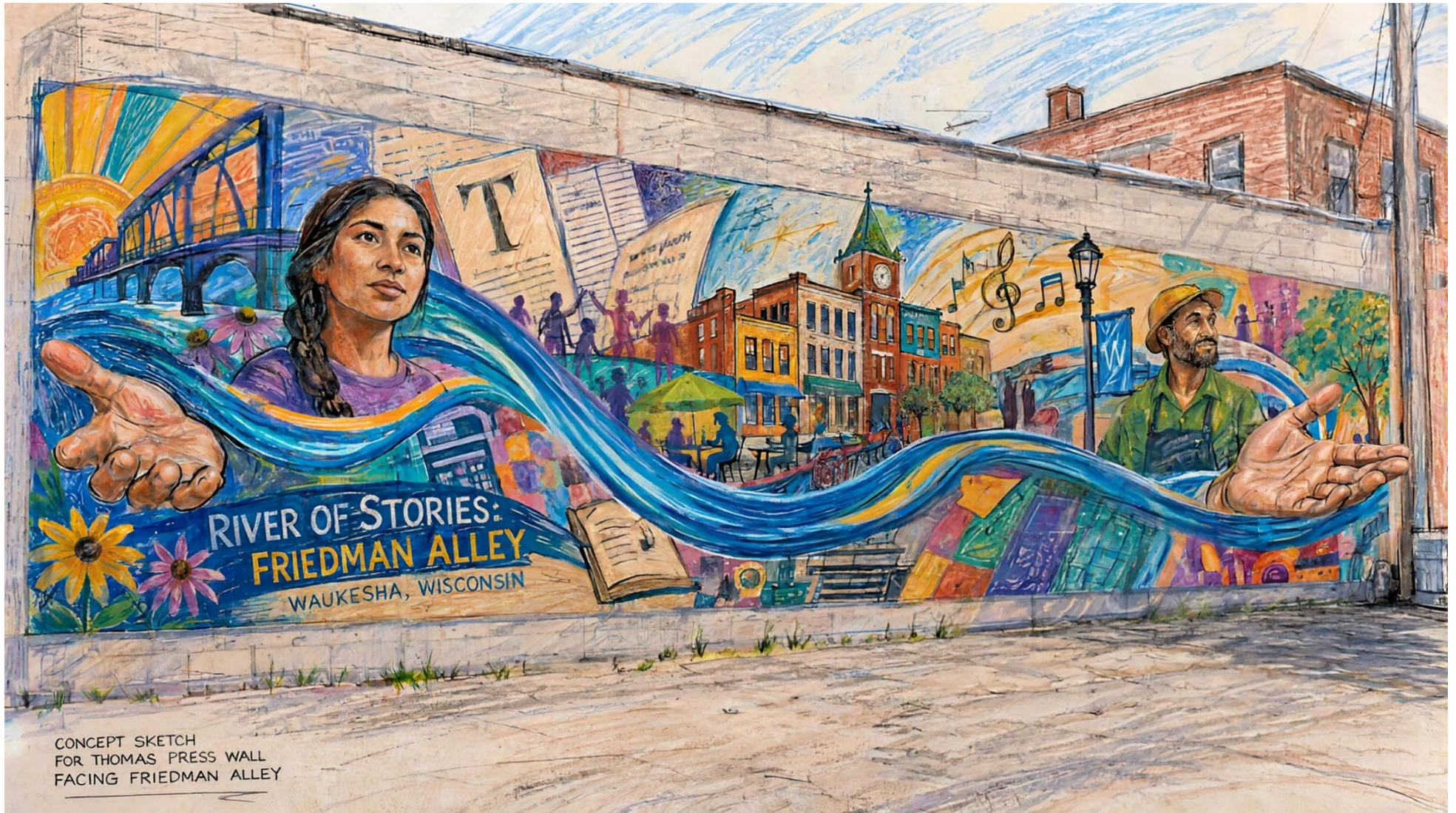
CONCEPT SKETCH FOR THOMAS PRESS WALL FACING FRIEDMAN ALLEY