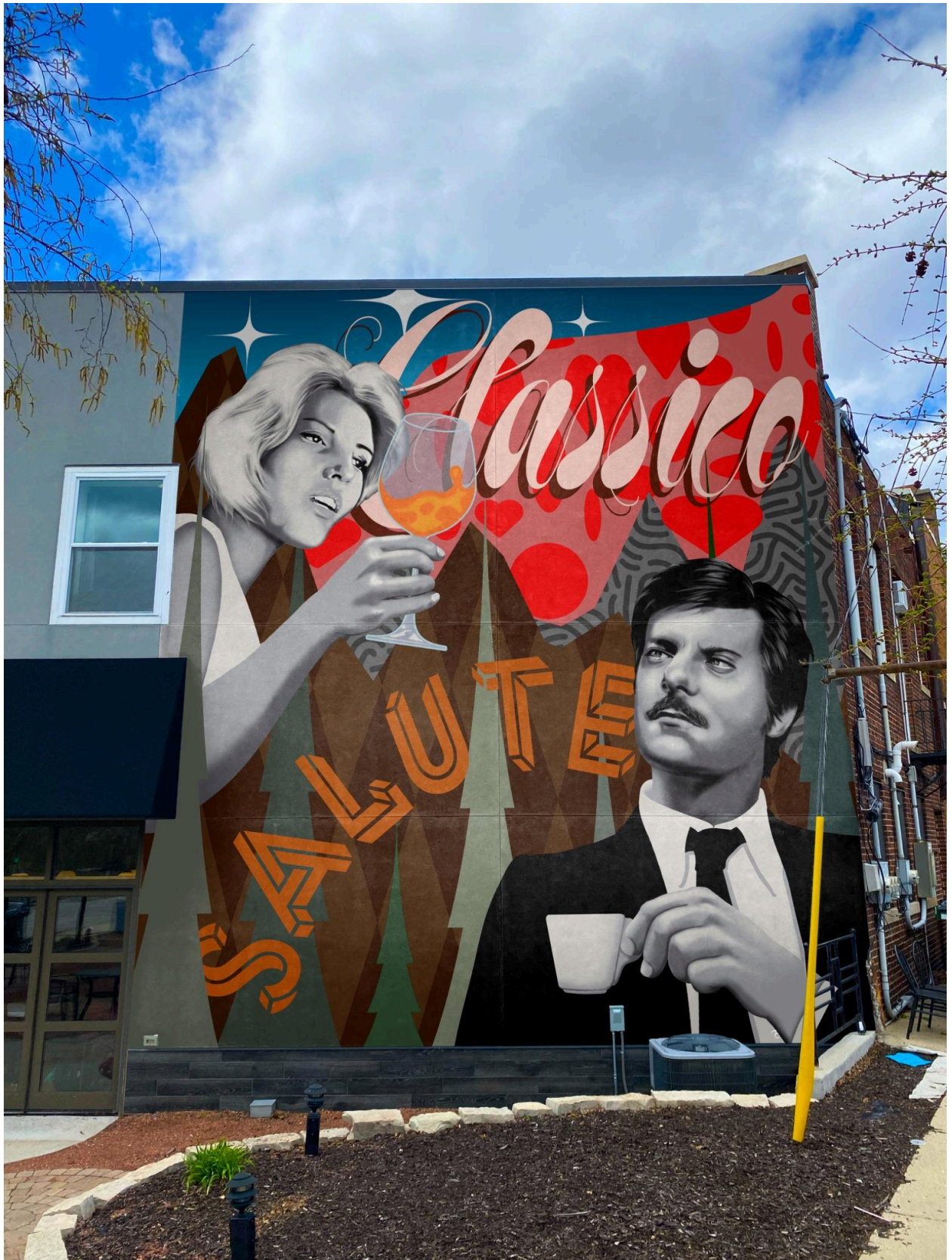
Mockup for upcoming project, Vendetta Coffee, Milwaukee