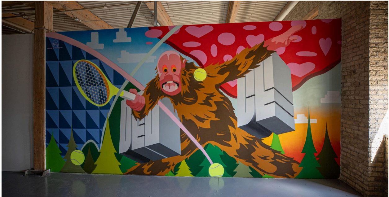
House of Rad, Milwaukee, 2026