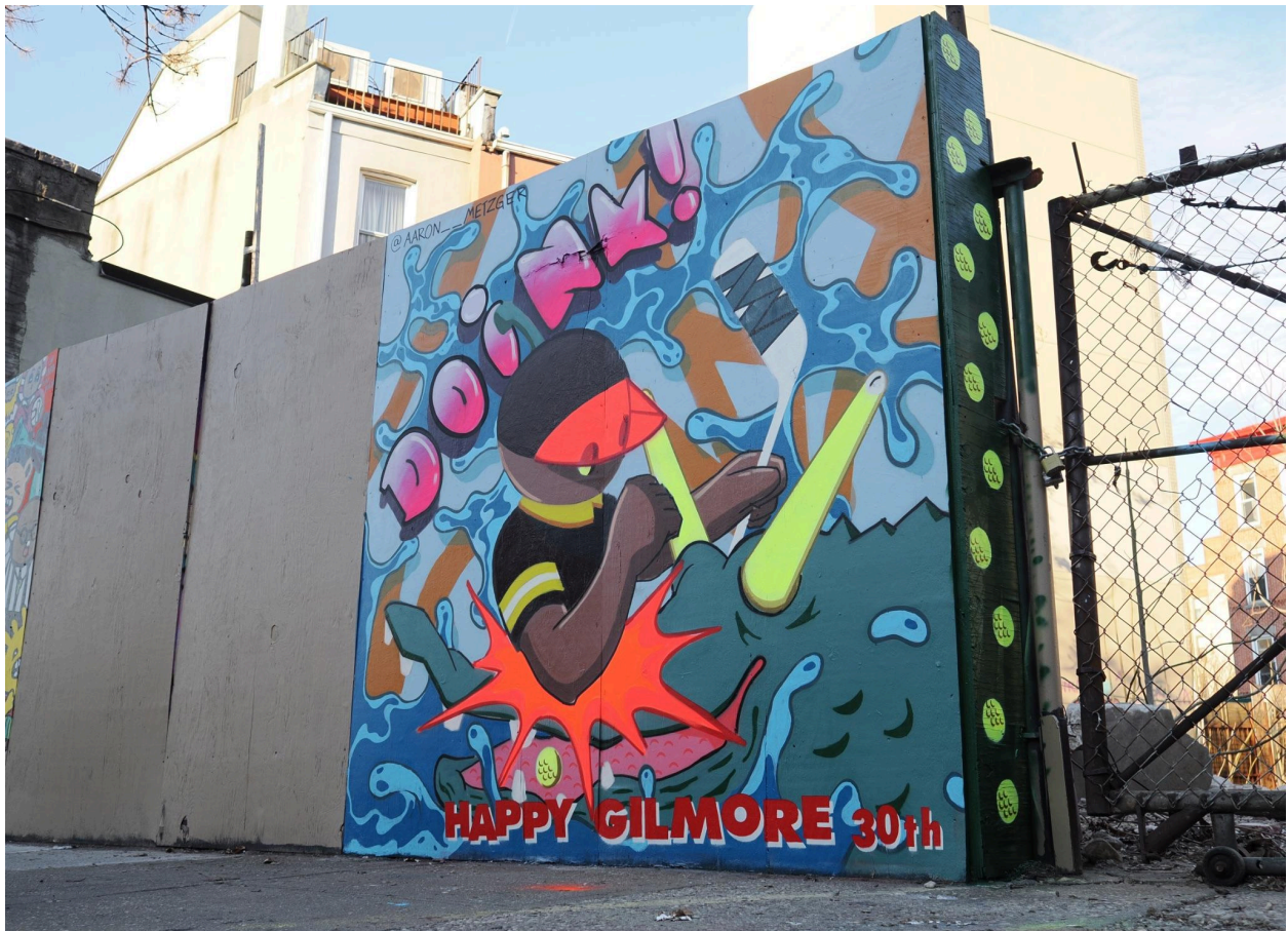
Washington Walls, Brooklyn, 2026