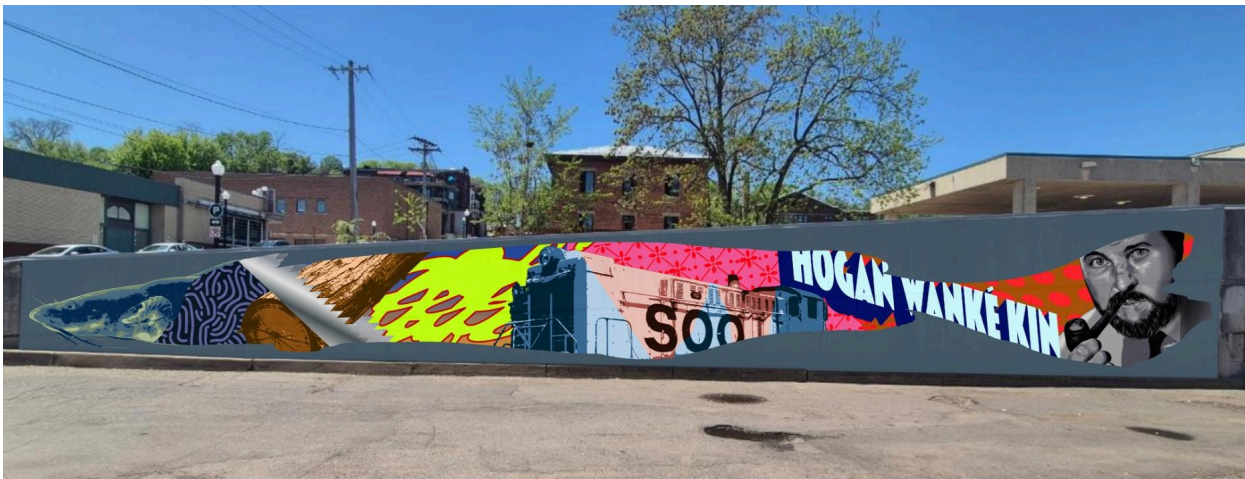
Mockup for upcoming project, Stillwater, MN